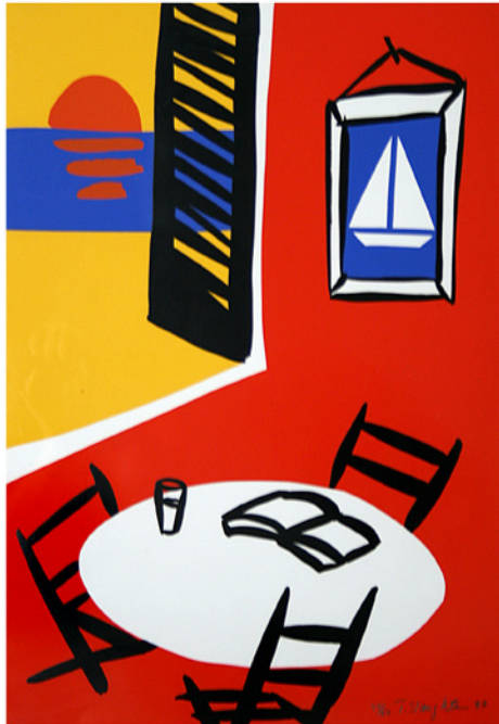
Both: Summer 1992, 1993 Multi colored screen print 27 1/2 x 19 1/2 in. (69,9 x 49,5 cm) Collection of Art in Embassies, Washington, D.C.; Gift of the Foundation for Art and Preservation in Embassies