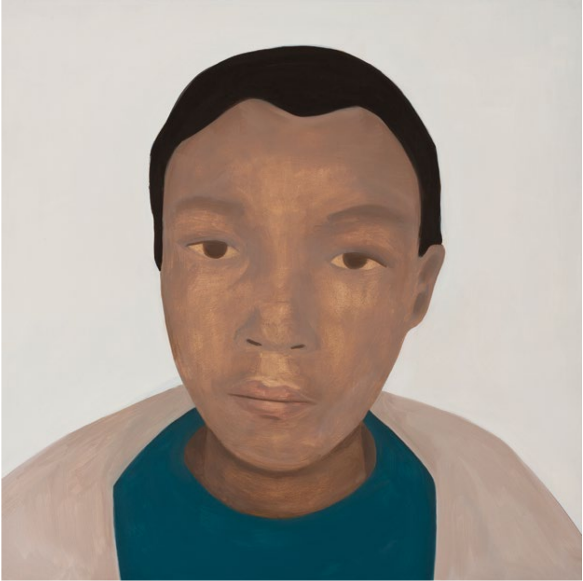
Anene (After Anene Booysen), 2013 Oil on canvas, 19 1/6 x 19 1/6 in. (50 x 50 cm) Courtesy of the artist and Nando's UK Collection, London, United Kingdom

“Born in Bredasdorp in Western Cape, South Africa, she grew up and attended school there. Her death at the age of seventeen caused a national outcry about gender-based violence.”