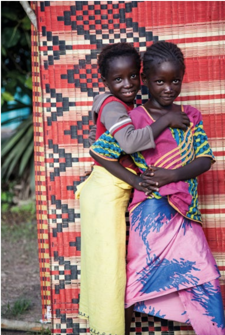
Thread series, 2013 Photograph, 20 x 16 in. (50,8 x 40,6 cm) Courtesy of the artist, Brooklyn, New York

Producer and artist Anna Groth-Shive creates work that straddles both commercial production and fine art photography. Thread series is a collection of photographs from her travels to southeastern Senegal as part of Thread, an artist residency supported by the Josef and Anni Albers Foundation. The foundation promotes the achievements of the couple, artistic adventurers and twentieth-century modernist pioneers, and the aesthetic and philosophical principles by which they lived, offering several residencies in different countries. viii Thread is located in Sinthian, a rural village in Tambacounda, and allows artists from Senegal and around the world to further their work and to work with local artists to preserve traditional practices and facilitate new ones. ix