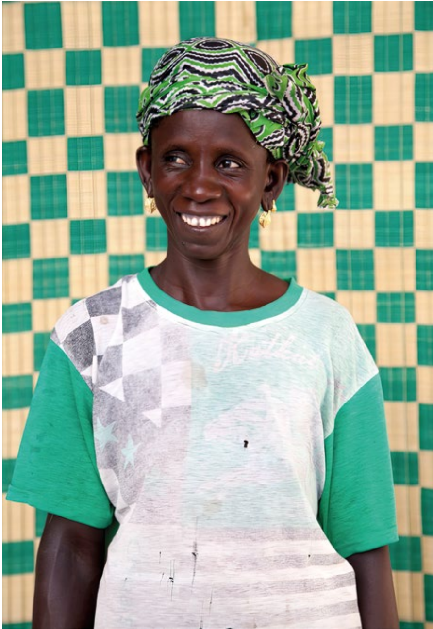
Thread series, 2013 Photograph, 20 x 16 in. (50,8 x 40,6 cm)