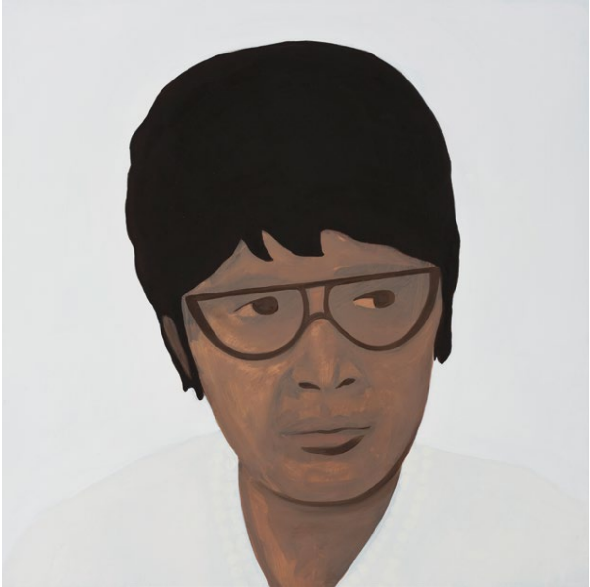
Mother (After Winnie Madikizela-Mandela), 2013 Oil on canvas, 19 1/16 x 19 1/16 in. (50 x 50 cm)

“South African activist and politician, sometimes referred to as ‘Mother of the Nation’.”