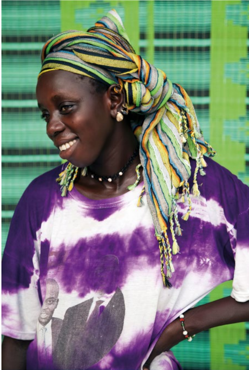
Thread series, 2013 Photographs, 20 x 16 in. (50,8 x 40,6 cm) each