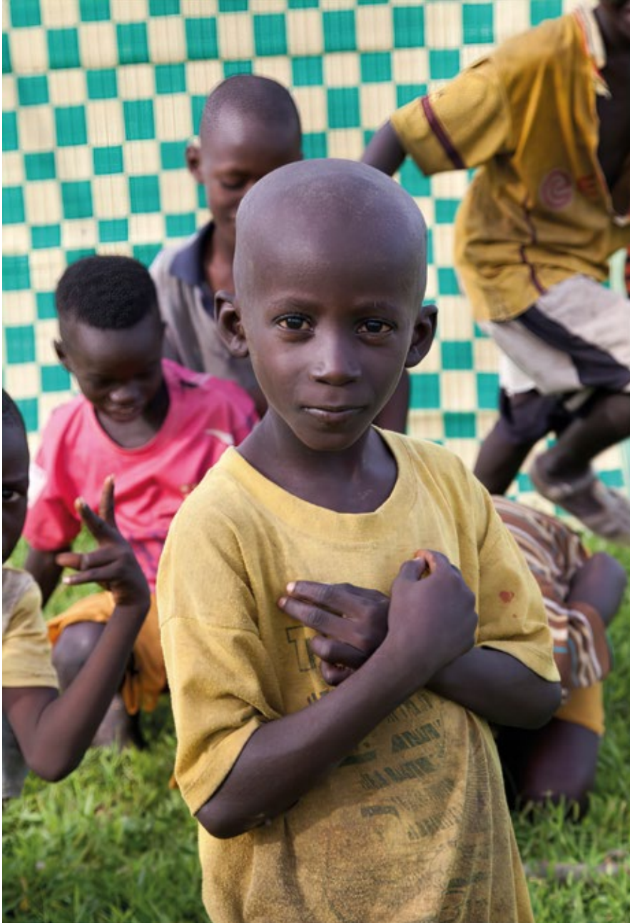
Thread series, 2013 Photographs, 20 x 16 in. (50,8 x 40,6 cm) each