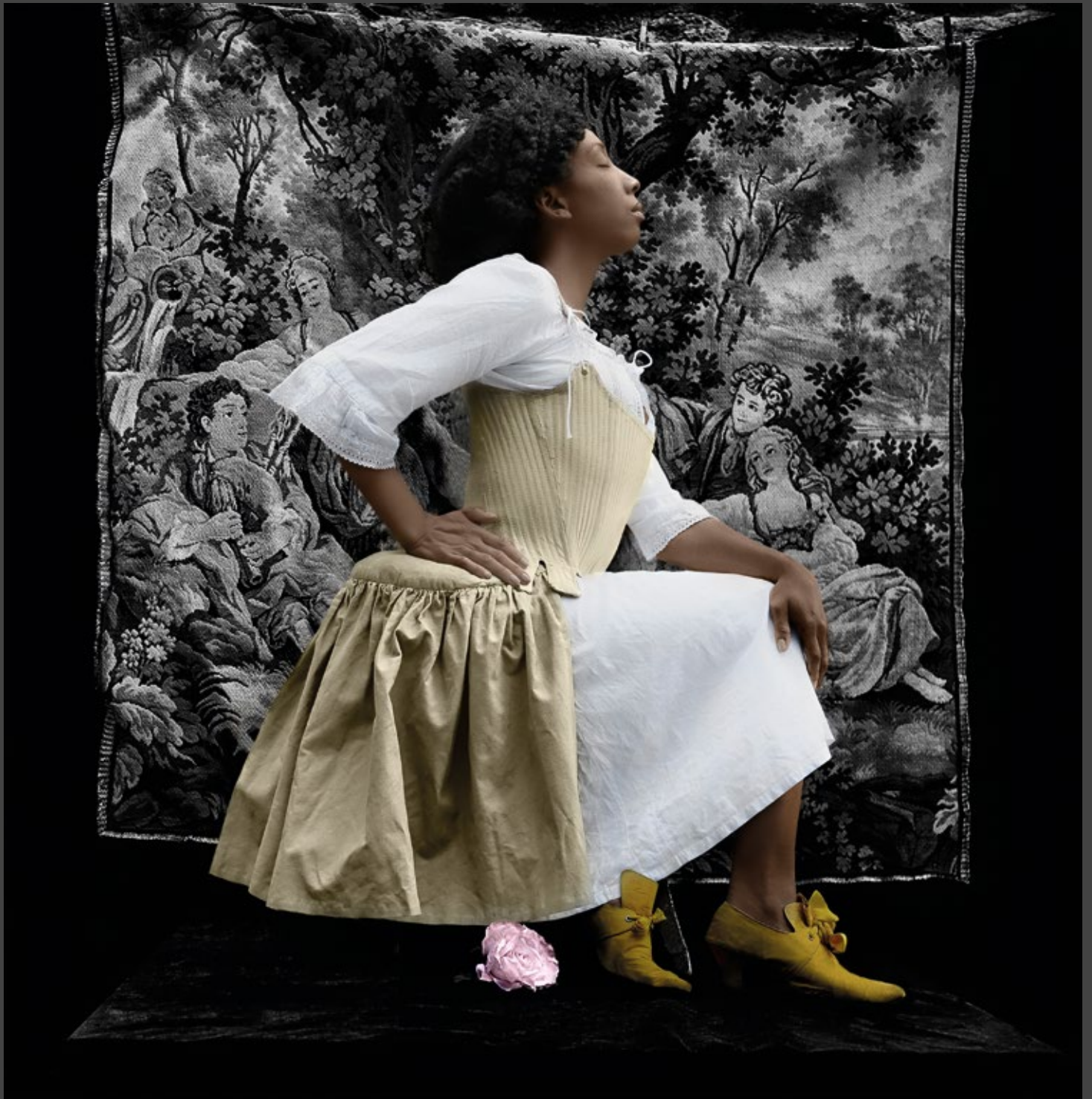
Art in Embassies Exhibition U.S. Mission to the African Union