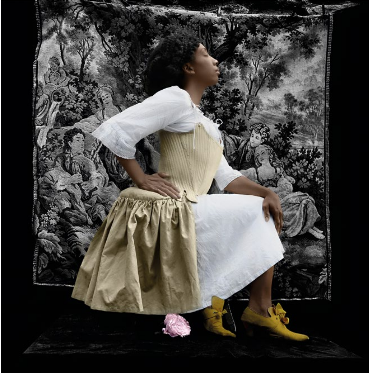
Sleep to Dream, 2017 Archival pigment print on German etching paper, 41 \frac{3}{4} x 42 \frac{1}{2} in. (106 x 108 cm) Courtesy of the artist and Marianne Ibrahim Gallery, Chicago, Illinois