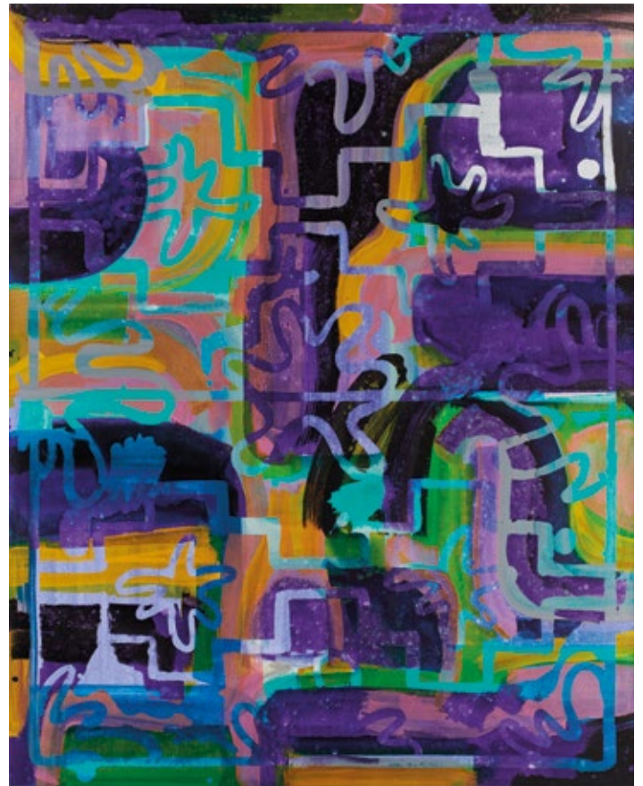
Sea Mop , 2019 Acrylic on canvas, 60 x 48 in. (152,4 x 121,9 cm)