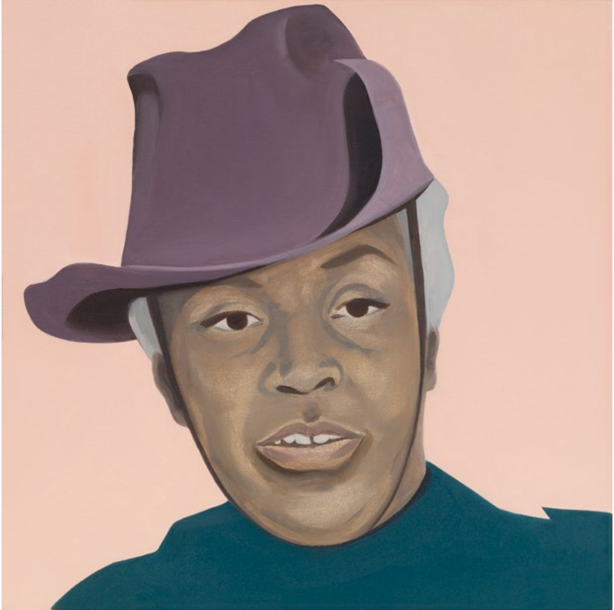
Kennedy (After Florynce Rae Kennedy), 2017 Oil on canvas, 19 1/6 x 19 1/6 in. (50 x 50 cm)

"American lawyer, civil rights activist, and radical Black feminist."