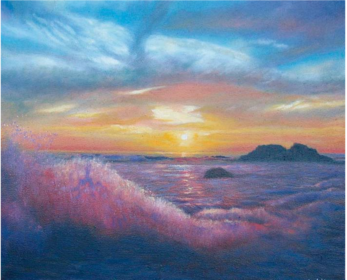
Laguna Sunset, 1988 Oil on canvas, 20 x 24 in. (50,8 x 61 cm)