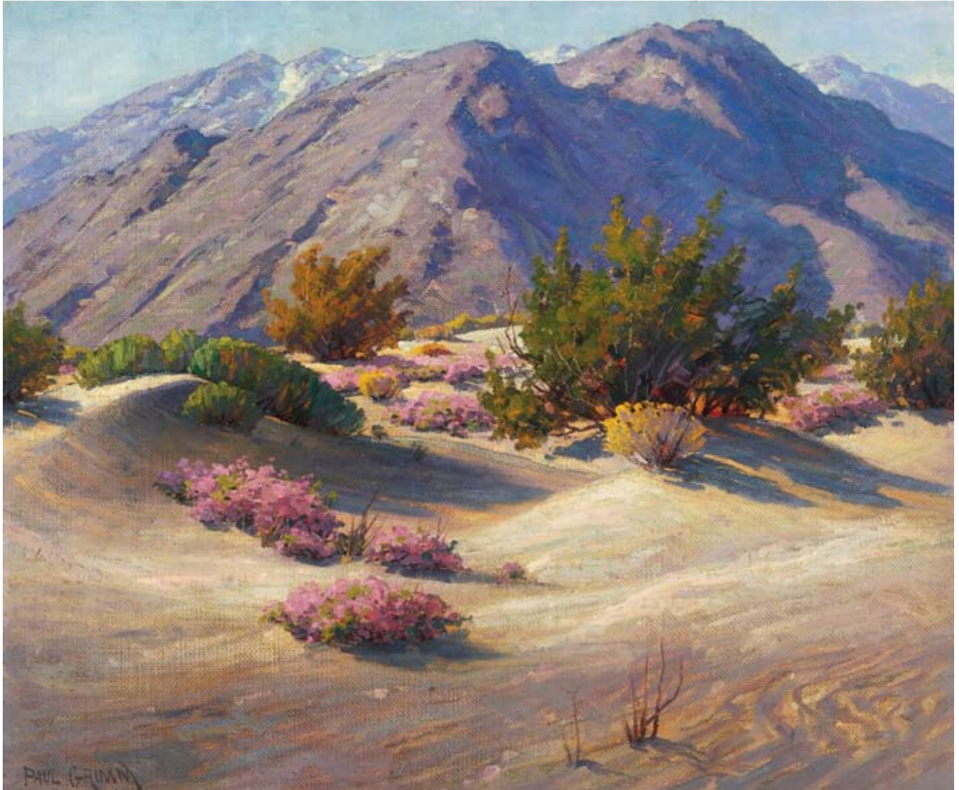
Sand Verbenas , undated Oil on amazonite, 20 x 24 in. (50,8 x 61 cm)