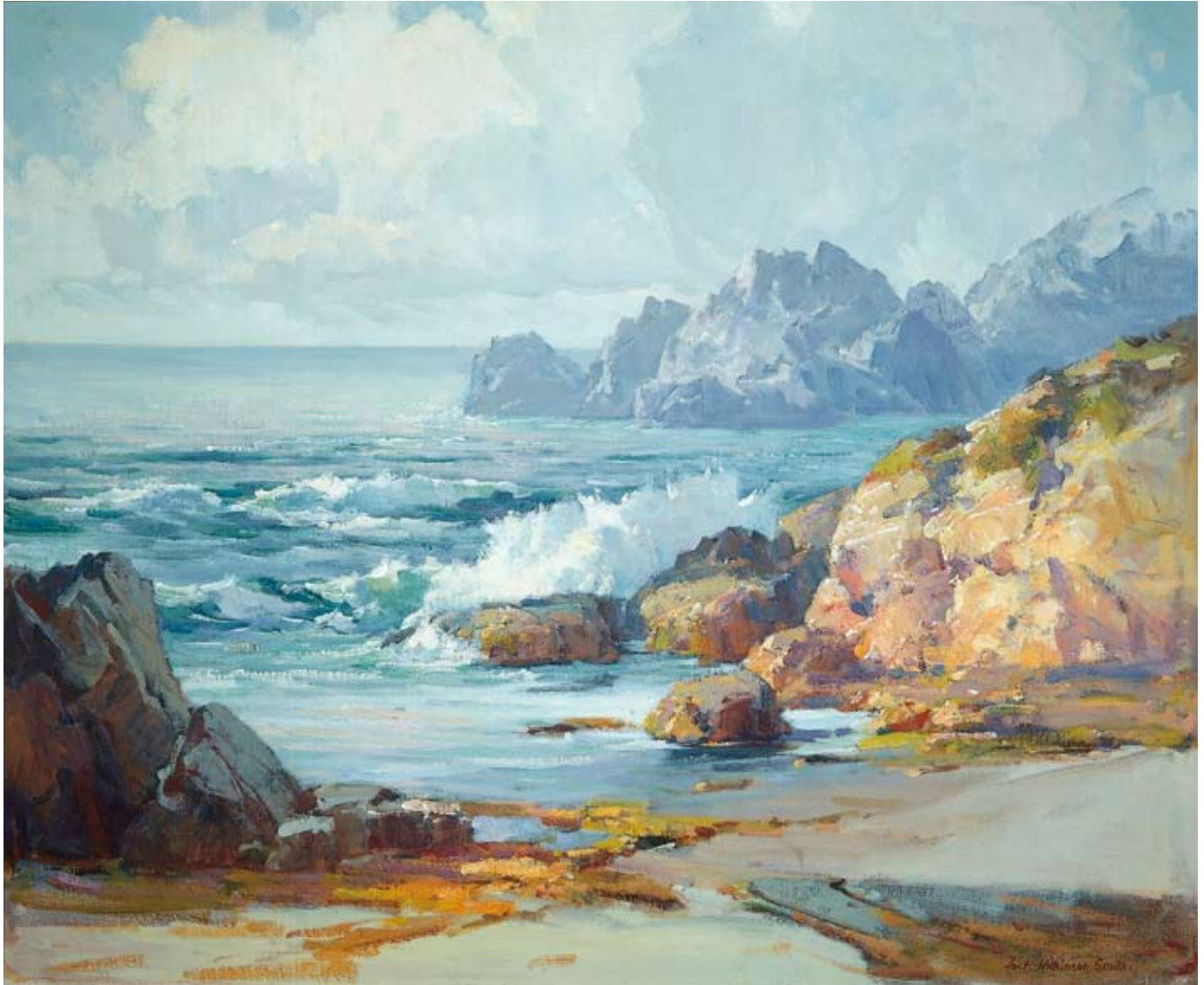
The California Coast , undated Oil on canvas, 24 x 30 in. (61 x 76,2 cm)