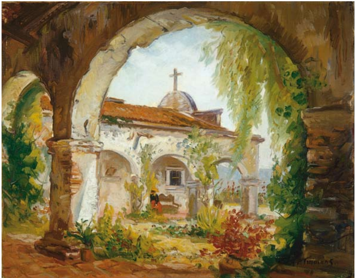
San Juan Capistrano Mission , undated Oil on canvas, 24 x 30 in. (61 x 76,2 cm)