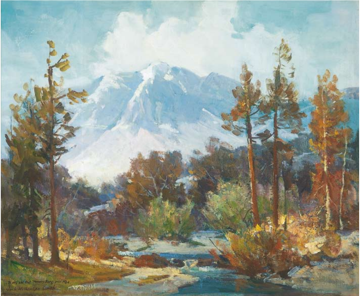
Tehachapes near Mojave , undated Oil on canvas, 24 x 30 in. (61 x 76,2 cm) Courtesy of Joan Irvine Smith Fine Arts, Inc., Newport Beach, California