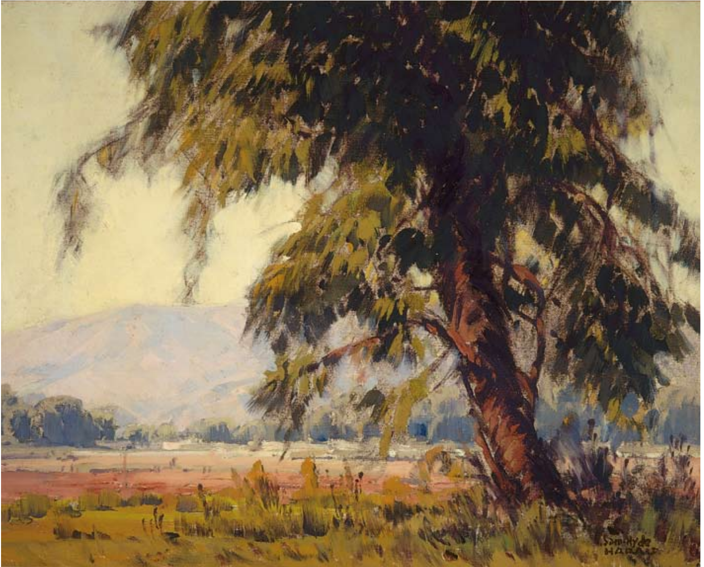
His Majesty , undated Oil on board, 16 x 20 in. (40,6 x 50,8 cm)