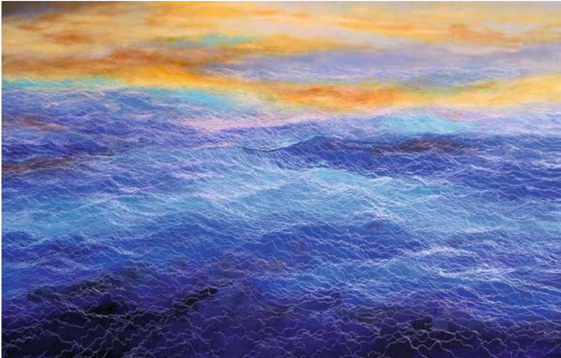
Encompassing I , 2014. Oil on linen, 57 x 89 in. Courtesy of the artist, Taipei, Taiwan