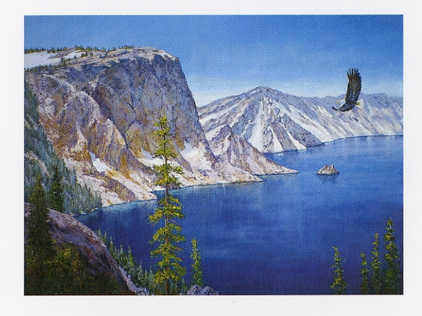
Soaring between Two Blues, 2003 Acrylic on canvas, 29 x 35 in. (73,7 x 88,9 cm)