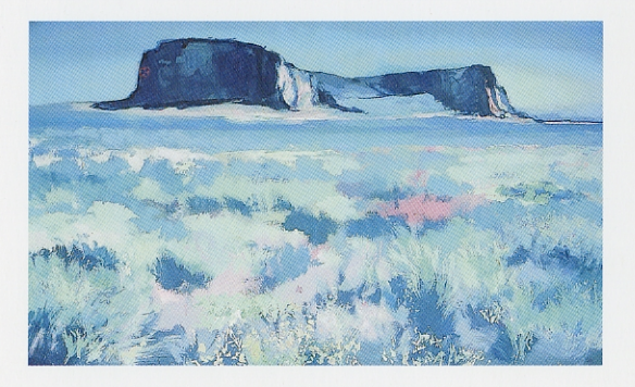
Fort Rock, 1987 Oil on canvas, 57 x 97 in. (144,8 x 246,4 cm)