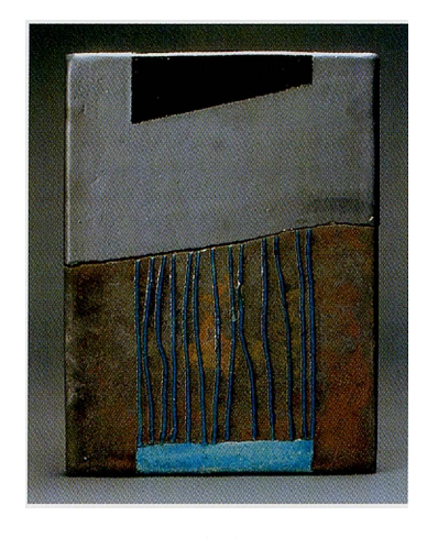
Occluded, 2003 Ceramic, 19 x 14 x 2 in. (48,3 x 35,6 x 5,1 cm)

Pagen has received numerous awards including the Oregon Arts Commission Individual Fellowship Grant (1986), the National Endowment for the Arts Artist's Fellowship Grant (1982), and the Contemporary Crafts Gallery's Residency Grant of one year as Ceramist-in-Residence (Portland, Oregon, 1979).