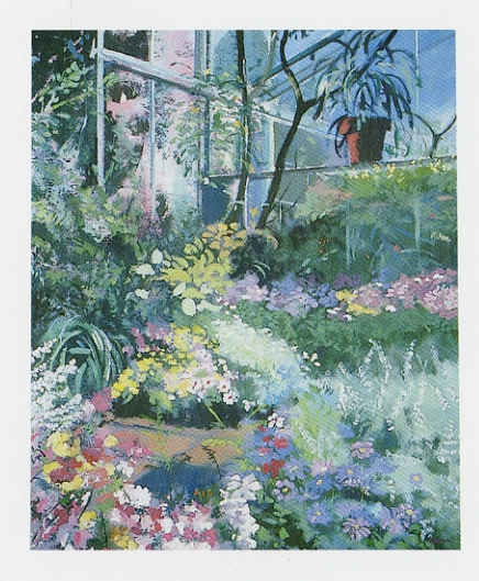
Wave Hill, 1994 Oil on canvas, 60 x 48 in. (152,4 x 121,9 cm)

Caron has been a watercolor instructor at Portland Community College in Oregon. Two of her paintings were purchased and placed in the Multnoma County City Hall and Courthouse by the county's Metropolitan Arts Commission for its Art in Public Places program.