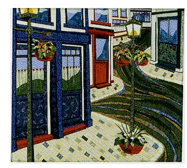
Cobblestones and Alleyways, 2002 Fiber appliqué and natural fiber materials, 32 x 34 in. (81,3 x 86,4 cm). Courtesy of the artists, Bend, Oregon