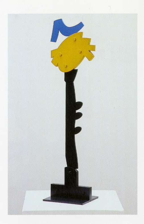
Sunra, with Blue (model), 2002 Painted steel, 28 ¼ x 7 ½ x 6 in. (71,8 x 19,1 x 15,2 cm) Courtesy of the artist, Portland, Oregon

Katz has received numerous fellowships and awards, including Oregon's Multnomah County Distinguished Artist Award (1999); the Oregon Governor's Award for the Arts, State of Oregon (1999); the National Endowment For the Arts Artist's Fellowship (1976); and the Western States Arts Foundation Artist's Fellowship (1975).