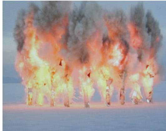
Bottom Right: Andréa Stanislav, Blow Away , 2009. HD video.