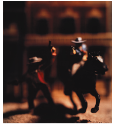
David Levinthal, Untitled (Wild West Series) , 2000. Polaroid ER Land film.