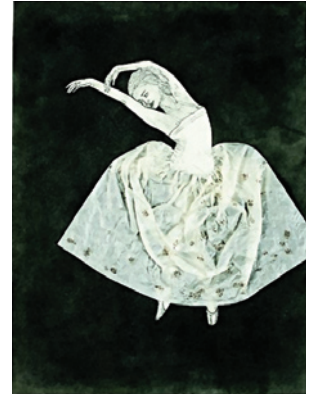
Kiki Smith. Ballerina (Stretching Left) , 2000. Etching and aquatint.