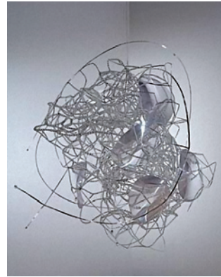
Alyson Shotz, Small Universe , 2007. Glass beads, glass lenses, and cut plastic.