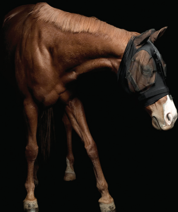
Elena Dorfman, Pleasure Park Horse , 2009. C-print on aluminum. Courtesy of the artist and the International Contemporary Art Foundation, Louisville, Kentucky.