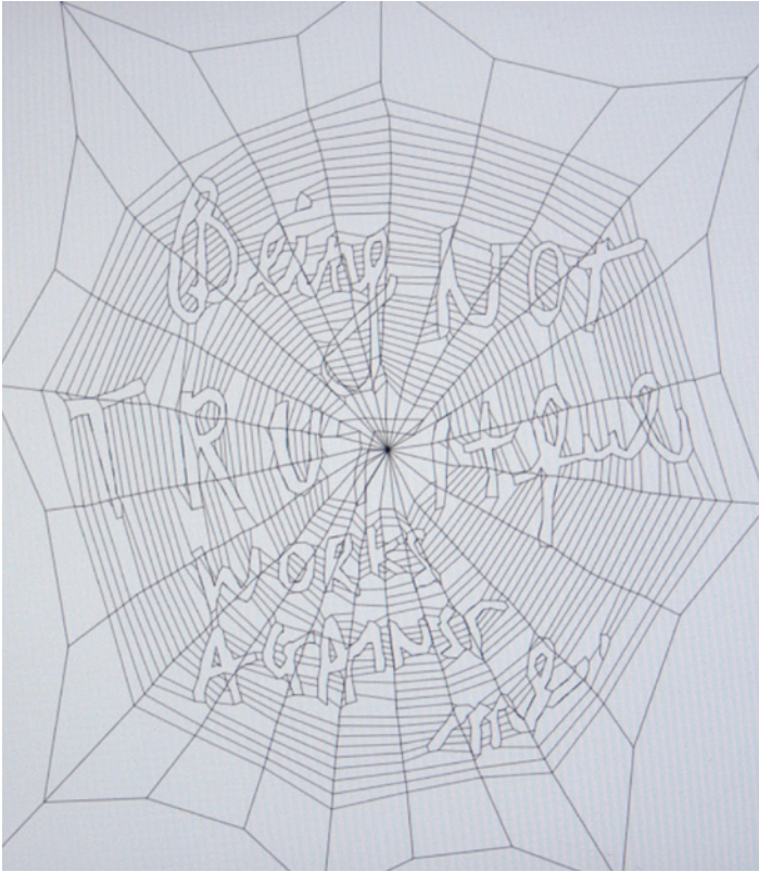
Stefan Sagmeister, Being Not Truthful Works Against Me , 2007. Interactive video. Computer, projector, camera.