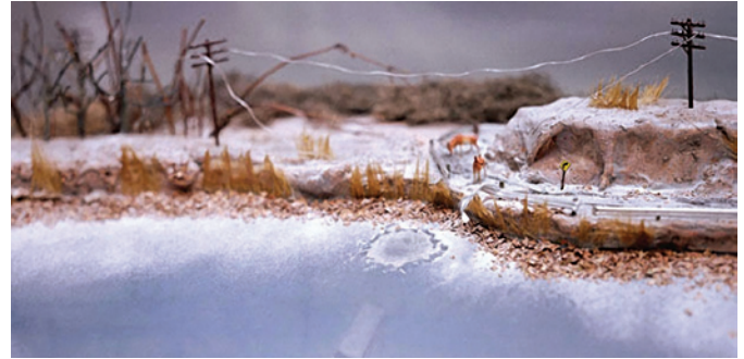
Lori Nix, Ice Storm , 1999. C-print.