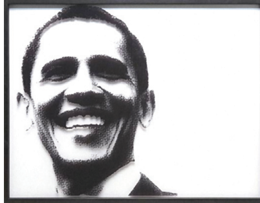
Upper Left: Letitia Quesenberry, peeled 8 , 2009. Dye sublimation on aluminum.