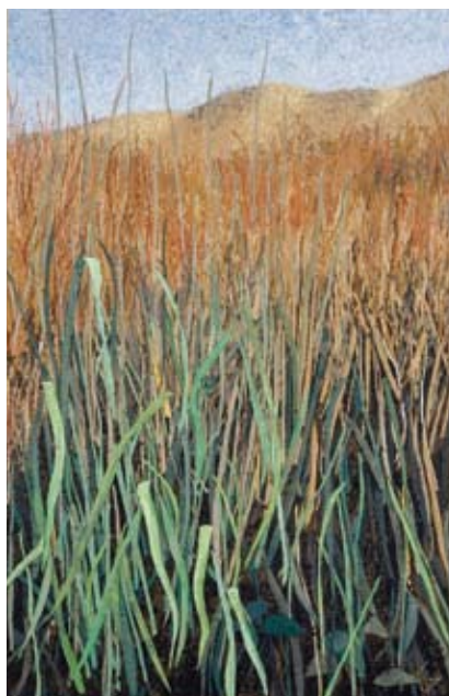
VERDANT GRASSES, 2006

Machine embroidered thread collage and appliqué tapestry, 39 ½ x 53 in. (100,3 x 134,6 cm).