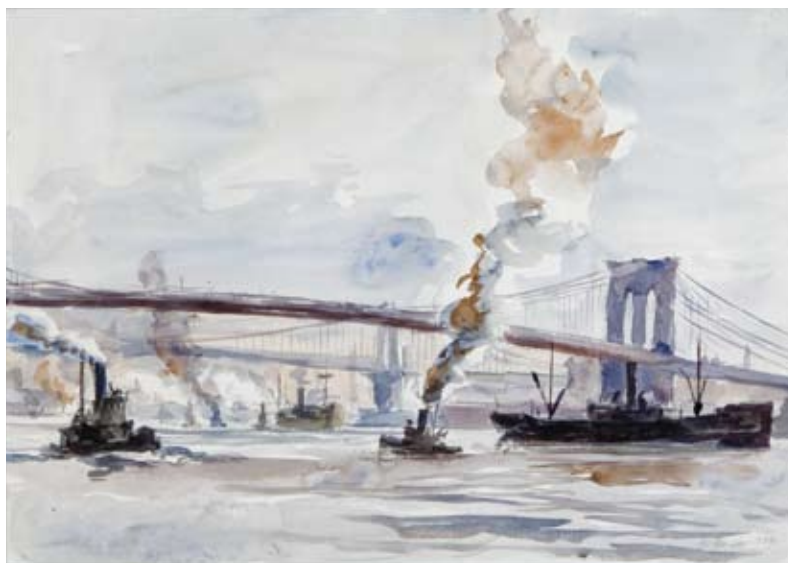
BRIDGES OVER EAST RIVER, NEW YORK , undated

Watercolor, 14 x 20 in. (35,6 x 50,8 cm). Gift of William Benton to the ART in Embassies Program, Washington, D.C.