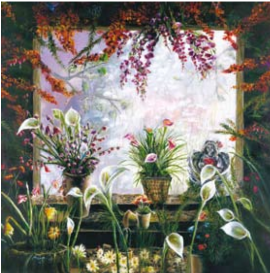
UPSIDE-DOWN/INSIDE-OUT , undated Giclée print on canvas, 48 x 48 in. (121,9 x 121,9 cm)