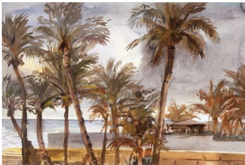
MIAMI BEACH , undated

Watercolor, 14 x 20 in. (35,6 x 50,8 cm). Gift of William Benton to the ART in Embassies Program, Washington, D.C.