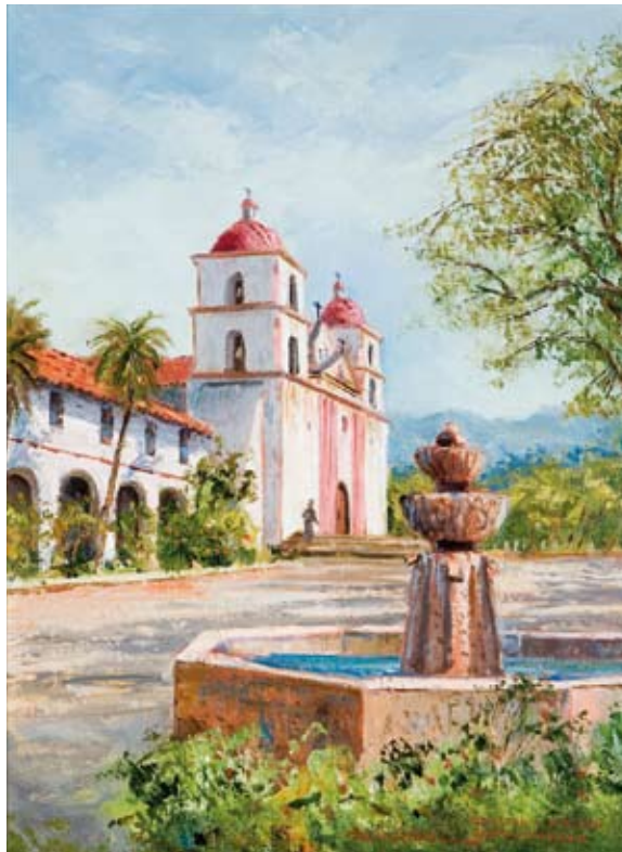
CALIFORNIA MISSION, SANTA BARBARA , undated. Oil on canvas, 23 ½ x 17 ½ in. (59,7 x 44,5 cm) Gift of the artist to the ART in Embassies Program, Washington, D.C.