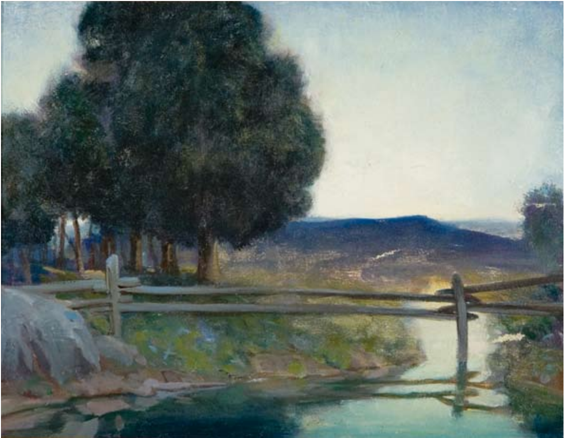
QUIET EVENING , c. 1938