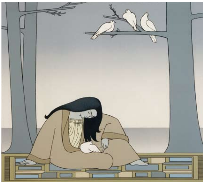
PAEAN (Edition 300) , undated

Silkscreen, 28 ¾ x 31 in. (73 x 78,7 cm).