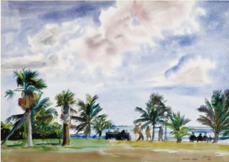
PALM TREES ON BEACH , undated

Watercolor, 21 ½ x 28 ¼ in. (54,6 x 71,8 cm)