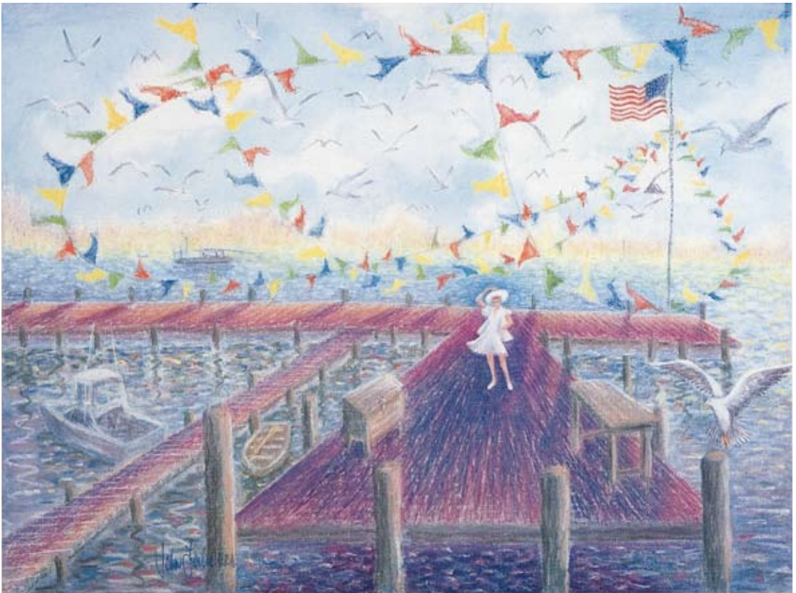
THE LAST DAYS OF SUMMER, 1987

docks, up to the twisting and turning of the various objects in the sky. A sense of movement is captured through the festive, flapping banners, the swooping birds, the light glancing off the water's surface, and the windswept dress of the little girl, who must tightly grip her hat to keep it from flying away.