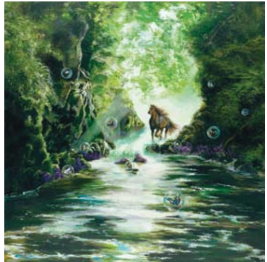
BUTTERFLY PASSION , undated, after a painting of the same title done in 2004. Giclée print on canvas, 48 x 48 in. (121,9 x 121,9 cm)