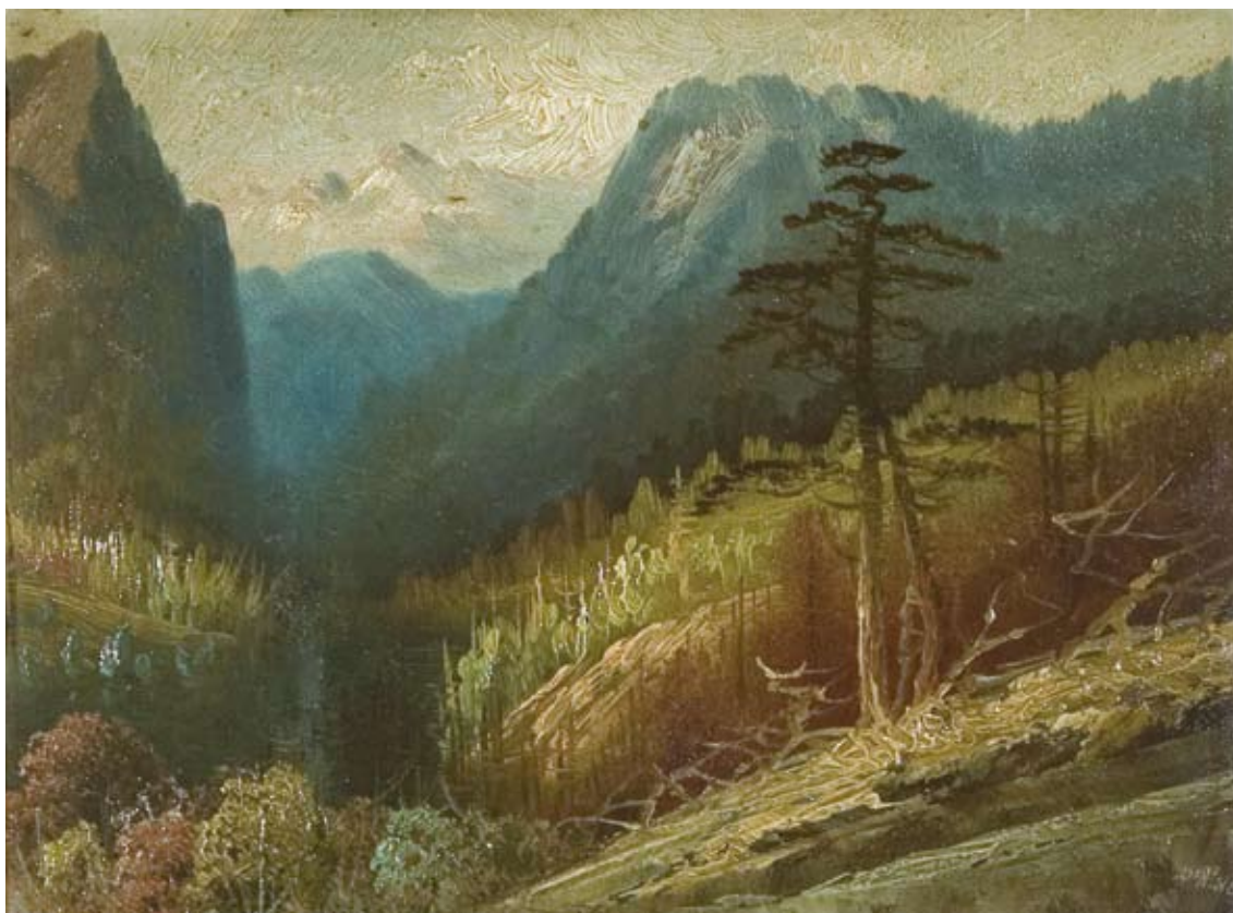
ROCKY MOUNTAIN LANDSCAPE, 1888

expanded westward, artists followed; their paintings feeding the national desire for information about the West, an area rapidly being settled, but about which little was known. While many artists chose to paint large, grandiose pictures of the awe-inspiring mountain scenery, others, as we see here, preferred smaller, more intimate scenes characterized by fidelity to nature and an overall sense of tranquility.