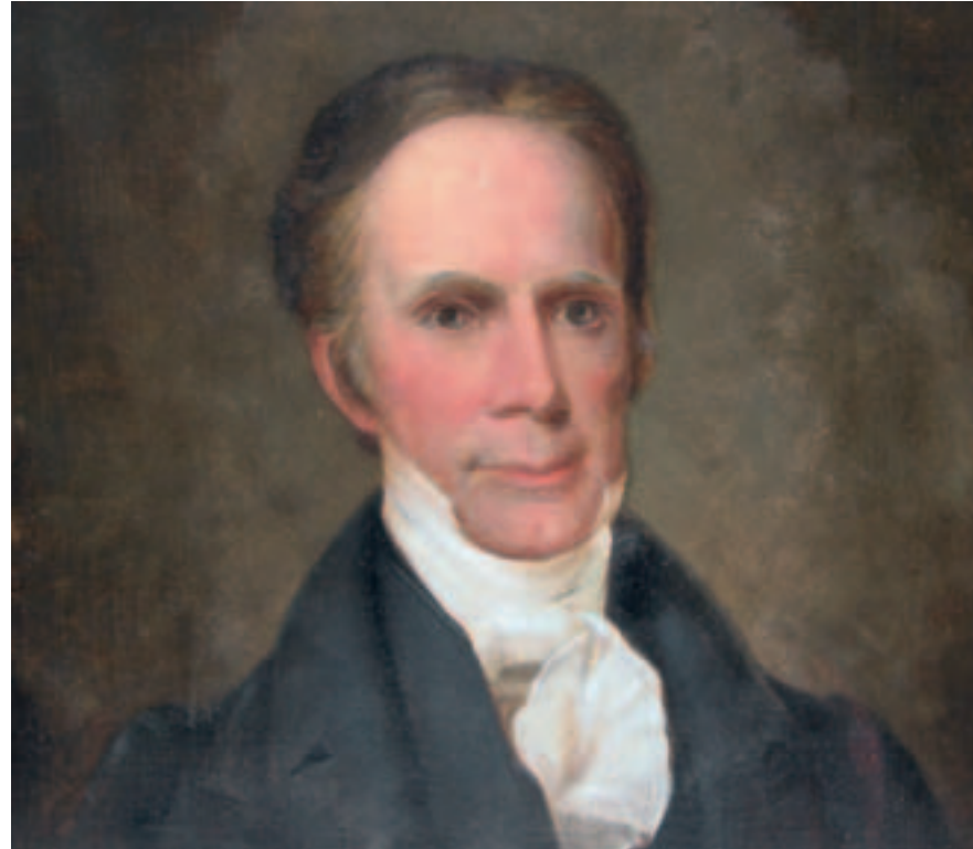
Portrait of Henry Clay [after James Reid Lambdin; original painted in 1840, date of copy unknown] Oil on canvas 28 x 33 in. (71,1 x 83,8 cm)