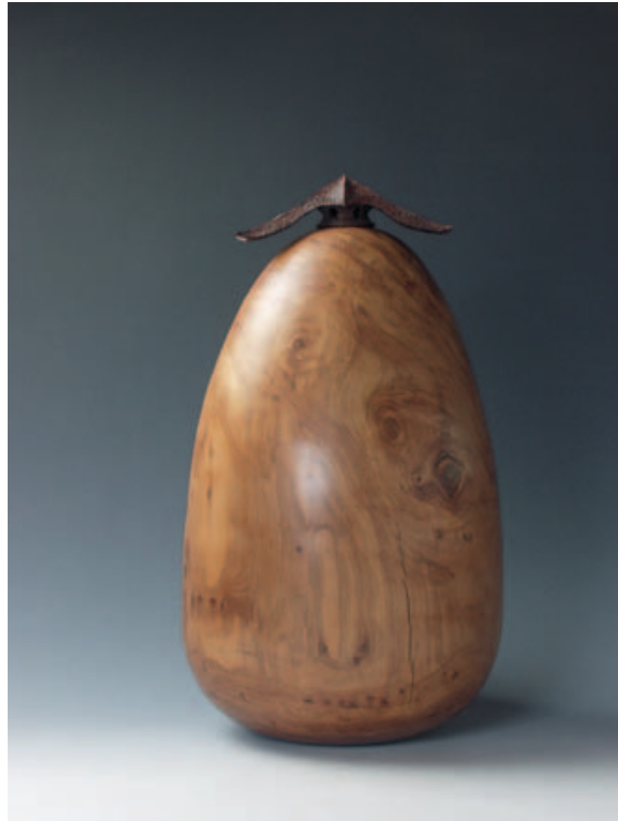
Hollow Apple Vessel with Pagoda Lid

http://www.kentuckyarts.org/j_fifield.htm