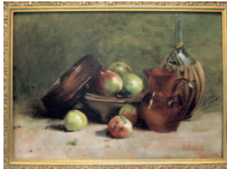
Untitled Still Life (Jug and Bowl of Apples)