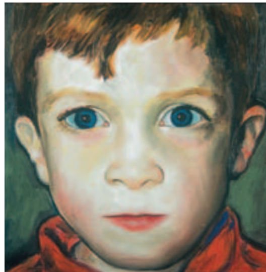
Jackson H. 2001 Oil on panel 12 x 12 in. (30,5 x 30,5 cm)