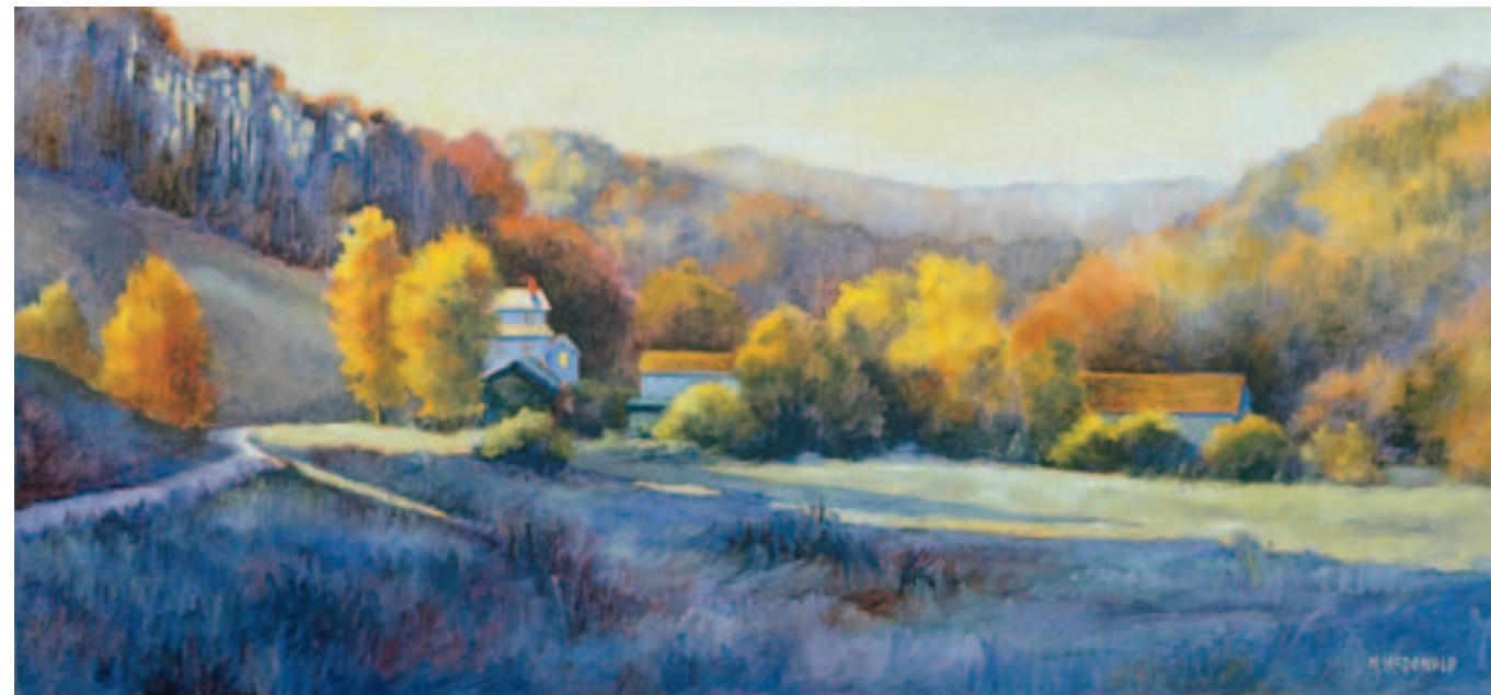
Mingo Valley First Frost 2001 Oil on canvas 14 x 30 in. (35,6 x 76,2 cm) Courtesy of the artist, Lexington, Kentucky

Lexington Herald-Leader , I began the Celebration Series , which focuses on expressive colors and fun subjects, such as the Purple Cow series. I find it refreshing to switch between the landscapes and the fun animal portraits. Recently, while looking for a creative challenge, I returned to oils. I use the pastel landscape sketches that show abstract qualities of the land. Then I push the color and rhythm of the image into the larger format of oils using the layering technique and luminosity of oils."