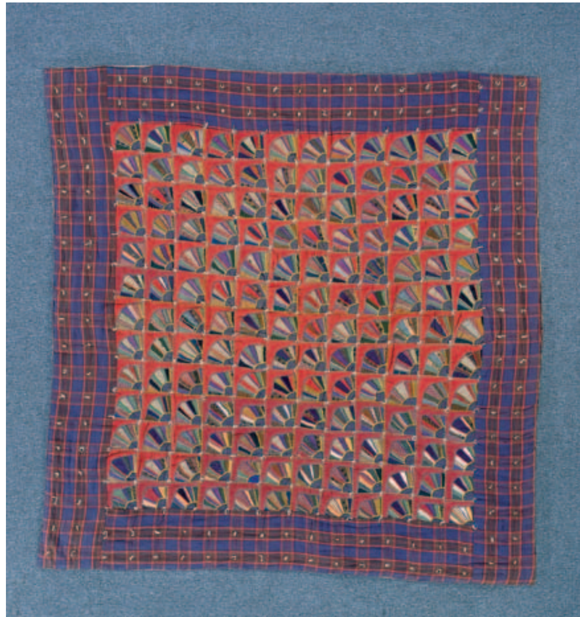
Miniature Fans c. 1910 Wool quilt 64 x 64 in. (162,6 x 162,6 cm) Collection of Shelly Zegart, Louisville, Kentucky