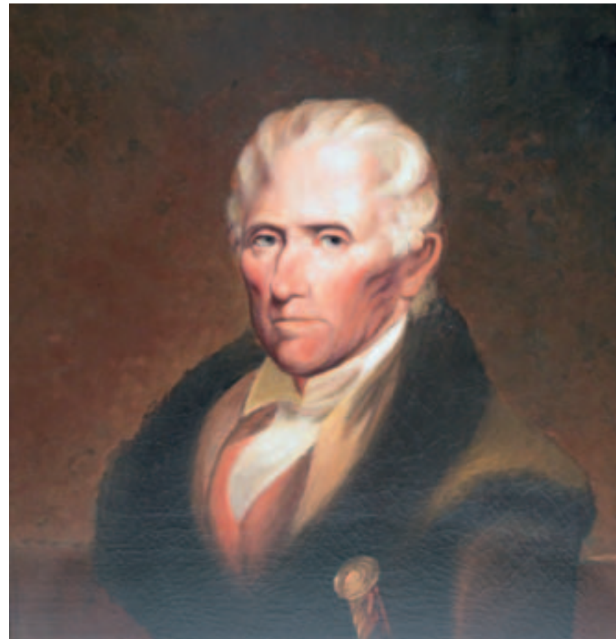
Portrait of Daniel Boone [after Chester Harding; original painted 1821, date of copy unknown] Oil on canvas 30 ¾ x 36 in. (78,1 x 91,4 cm)