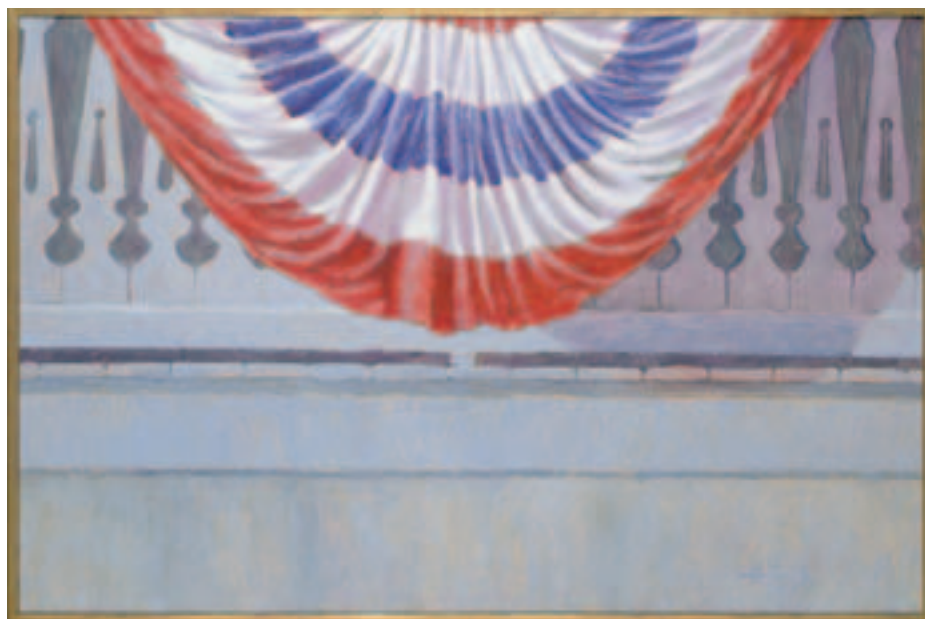
Flag undated Oil on canvas 28 x 42 in. (71,1 x 106,7 cm)