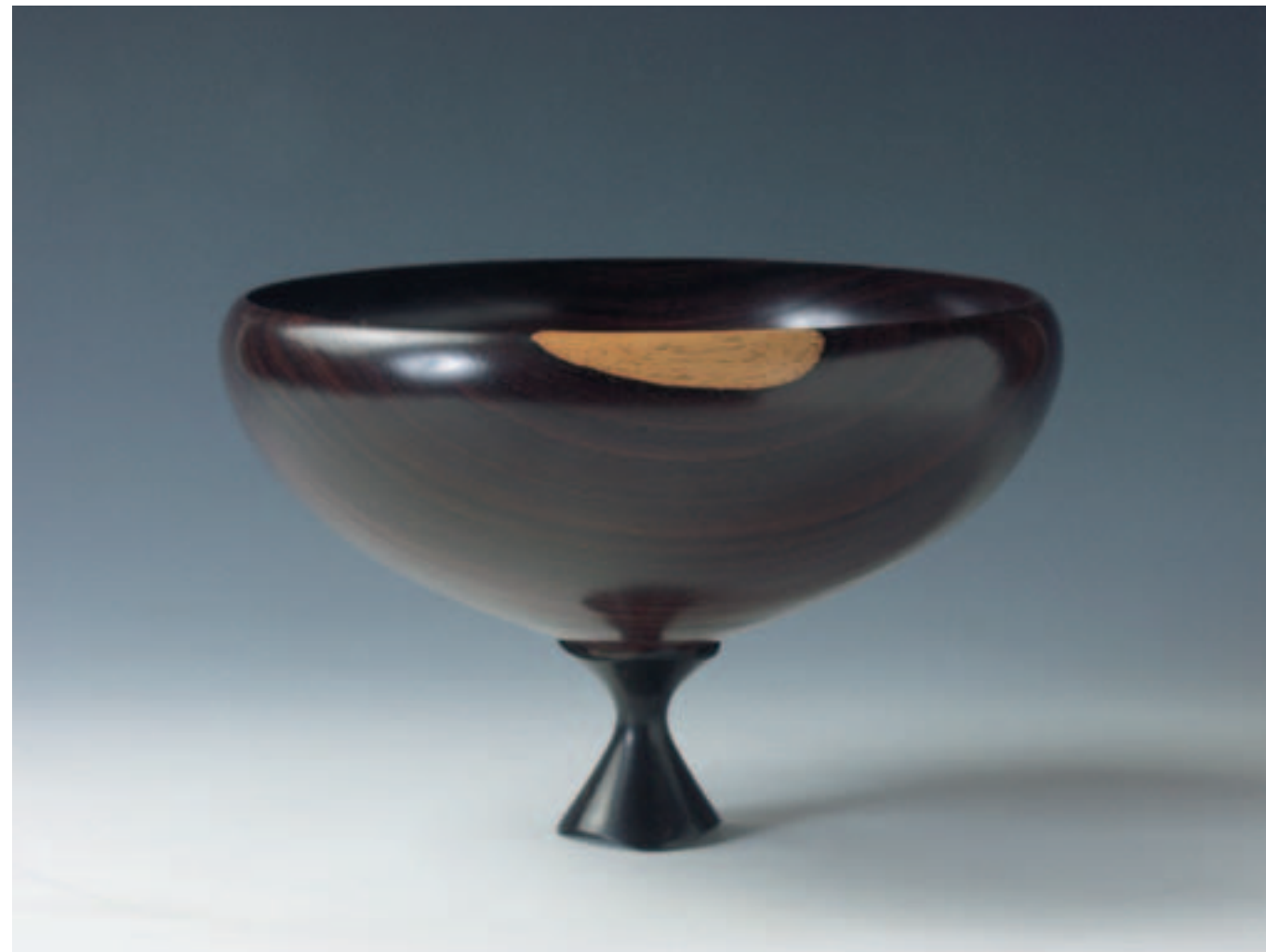
Elevated Bowl undated Cocobolo and ebony 6 x 8 x 8 in. (15,2 x 20,3 x 20,3 cm) Courtesy of Jack Fifield, McKee, Kentucky