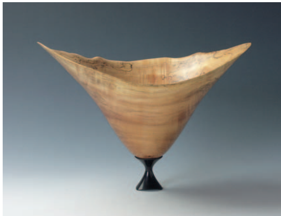
Natural Edge Bowl with Foot undated Maple and ebony 10 x 12 x 10 in. (25,4 x 30,5 x 25,4 cm)