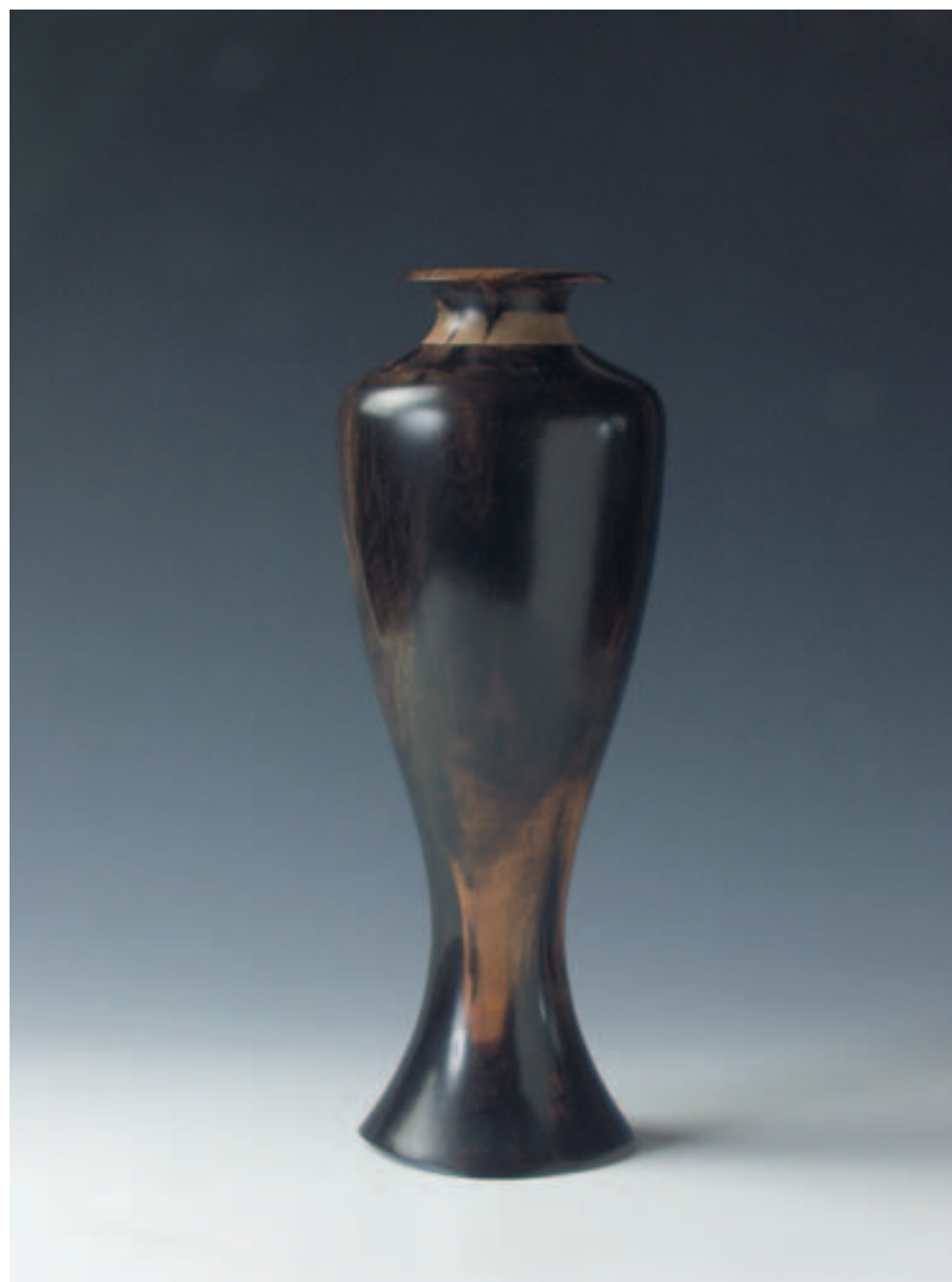
Black Vase undated Ebony and persimmon 14 x 5 x 5 in. (35,6 x 12,7 x 12,7 cm) Courtesy of Jack Fifield, McKee, Kentucky