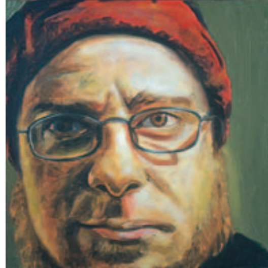
Scott S. 2001 Oil on panel 12 x 12 in. (30,5 x 30,5 cm)