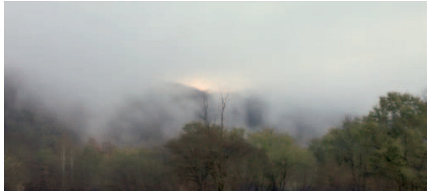
River Fog 2004

Archival digital photograph 8 x 18 in. (20,3 x 45,7 cm)