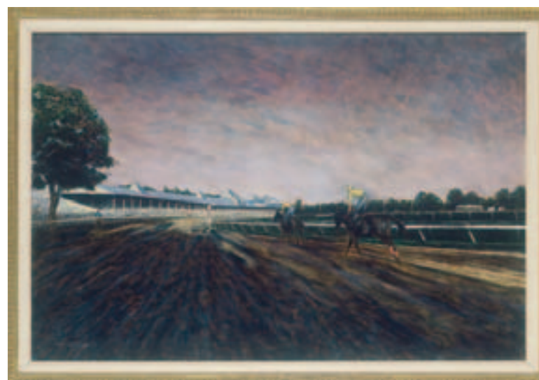
View of Grandstand, Saratoga 1984 Oil on canvas 24 x 36 in. (61 x 91,4 cm)