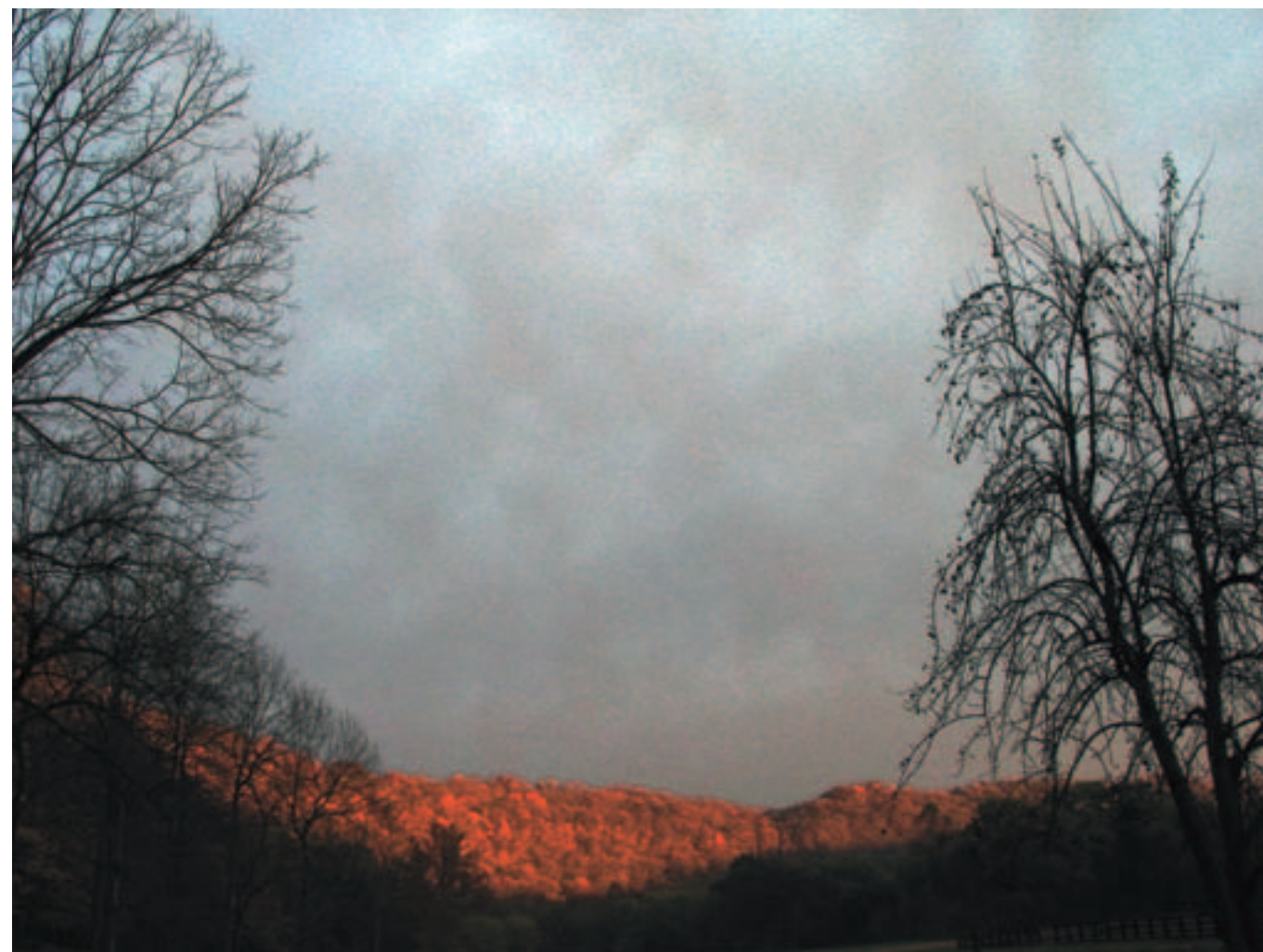
Red Hill 2003

Archival digital photograph 20 x 24 in. (50,8 x 61 cm)