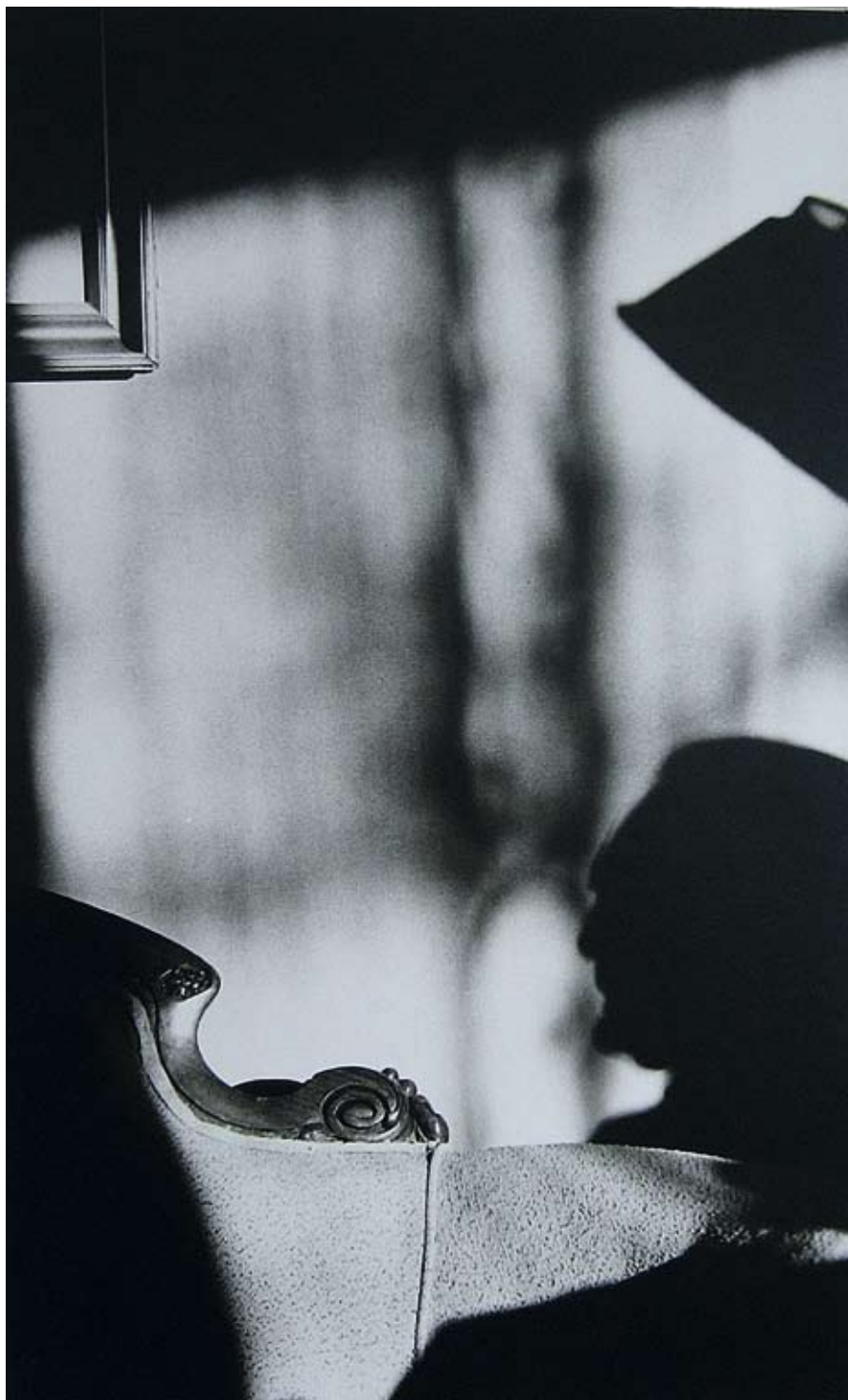
Untitled #1, 1987 Black and white silver print 12 7/8 x 8 in. (32,7 x 20,3 cm)

Of her work, Rowe says that "I have always been enamored with the ability of formal elements specific to the photographic medium (including compression of space, blur derived from motion, disparate focus associated with depth of field, contrasts of shadow and light, cropped subject matter, and multiple exposure) to alter subject matter as experienced by the eye. My work usually contains some combination of these elements, informed by the innovations of the modernist photographers working in Europe in the early part of the 20th century, whose work I greatly admire. My subject matter often comprises self portraiture, shadow and actual likenesses of loved ones, architectural structures (intact and ruined), historic photographs, and flowers. With respect to content, my photographic work is essentially a visual 'diary,' a pieced-together expression/representation of the flux of self and personal experience over time. The two photographs in this collection represent early periods of my work and feature the shadowed representation of human presence ( Untitled # 1 ) and photomontage ( Untitled # 2 ). Both photographs are black and white silver prints; additionally, Untitled # 2 is a hand-colored photomontage. My recent work is in the color film/print format."