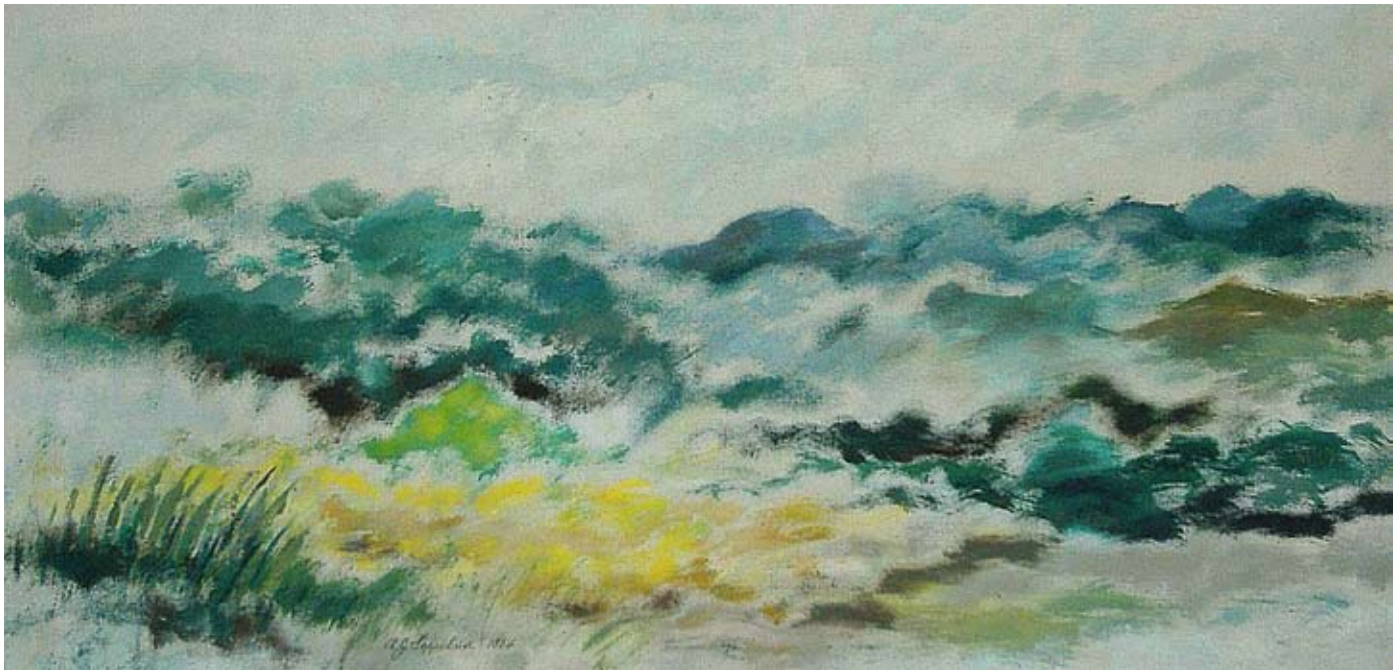
New Guinea Landscape (Markham Valley: Nadzab), 1964