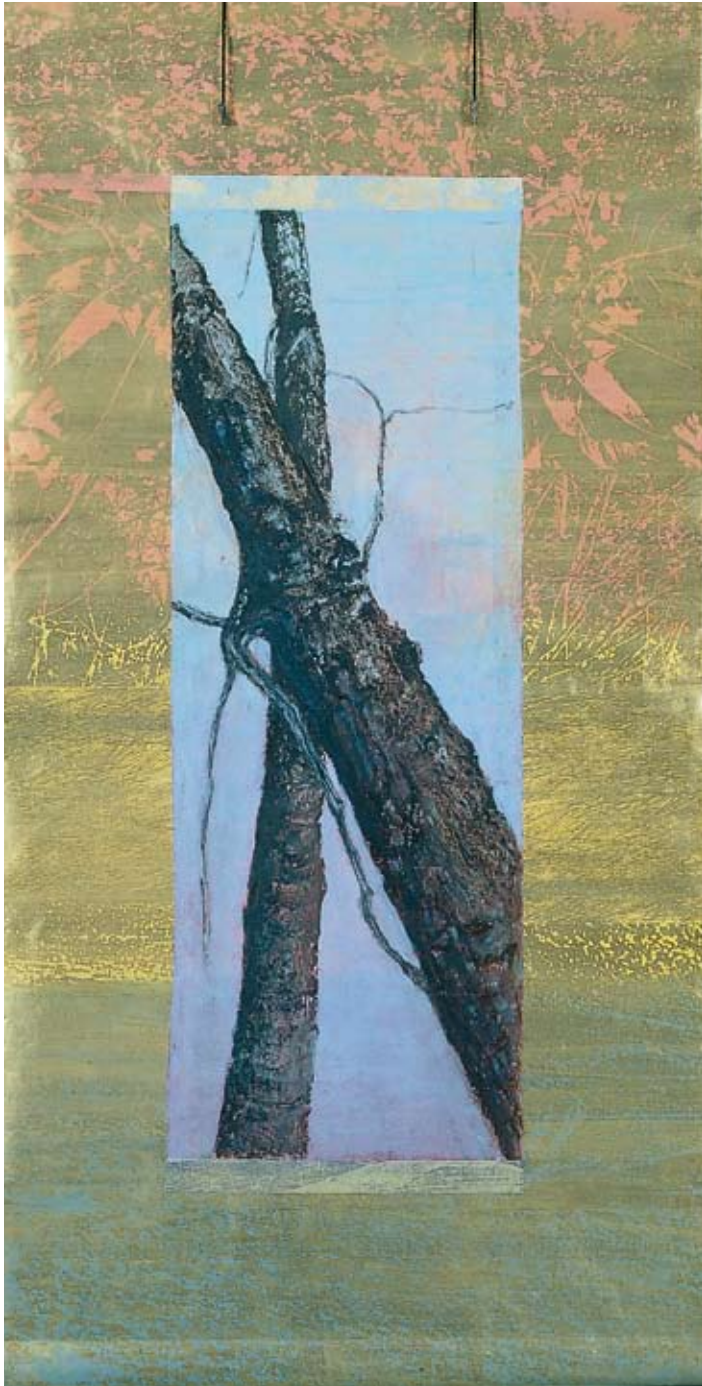
Cottonwoods of the Palouse I, 1994 Scroll on Tyvek printing and drawing 72 x 36 in. (182,9 x 91,4 cm) Courtesy of the artist, Portland, Oregon