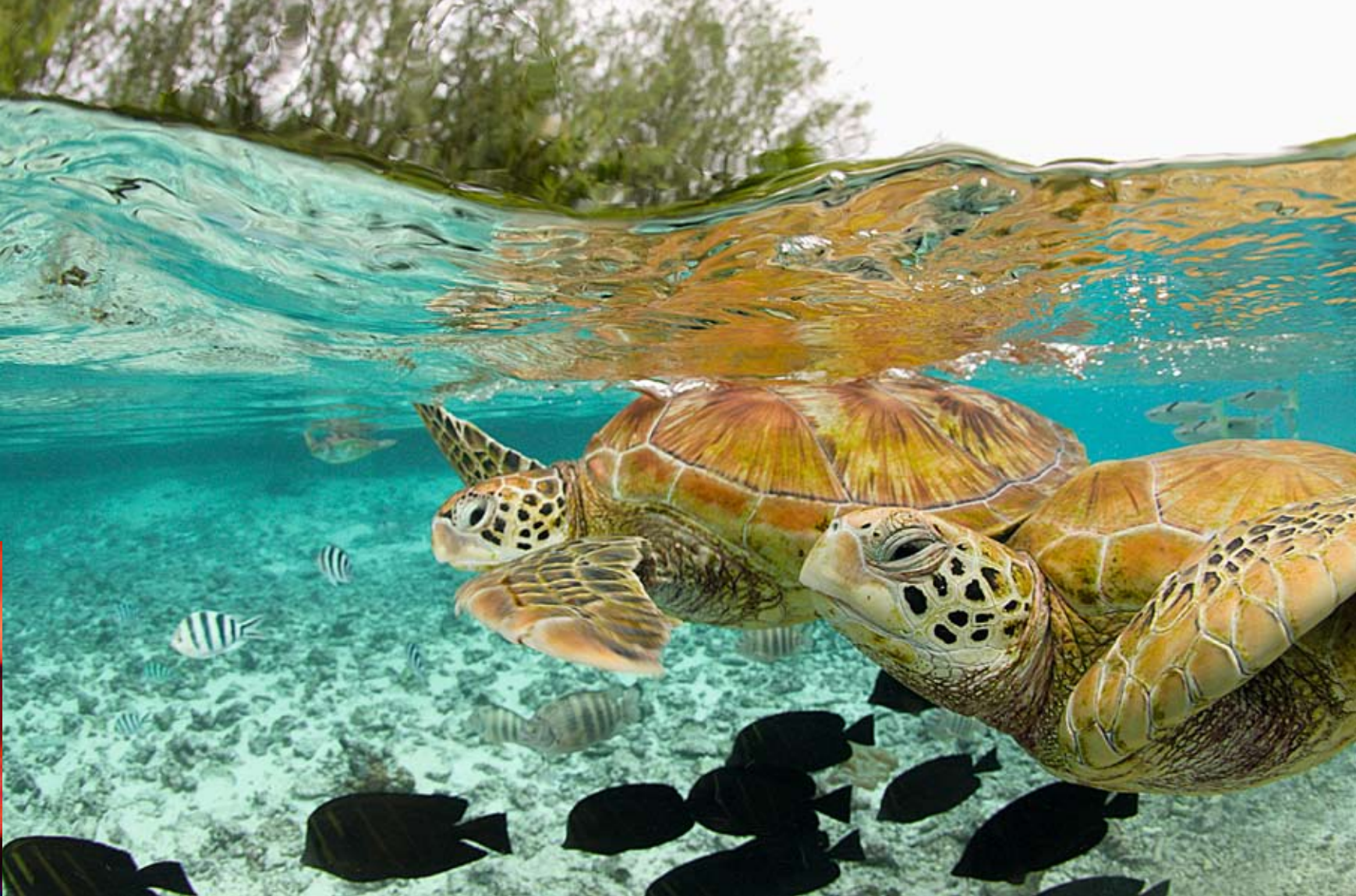
Turtles of Bora-Bora, 2006 Photograph on canvas paper 15 x 24 in. (38,1 x 61 cm)