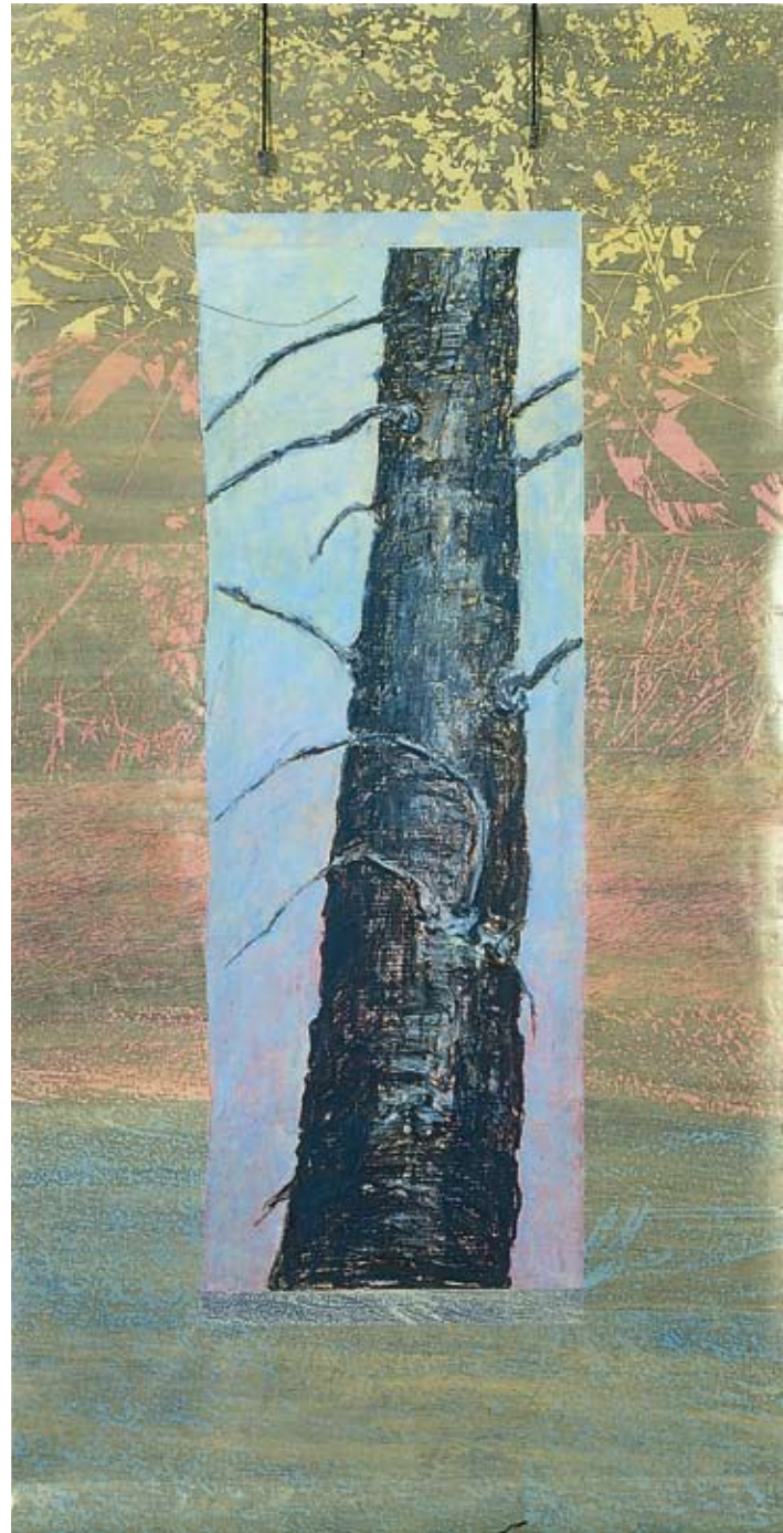
Cottonwoods of the Palouse II, 1994 Scroll on Tyvek printing and drawing 72 x 36 in. (182,9 x 91,4 cm)