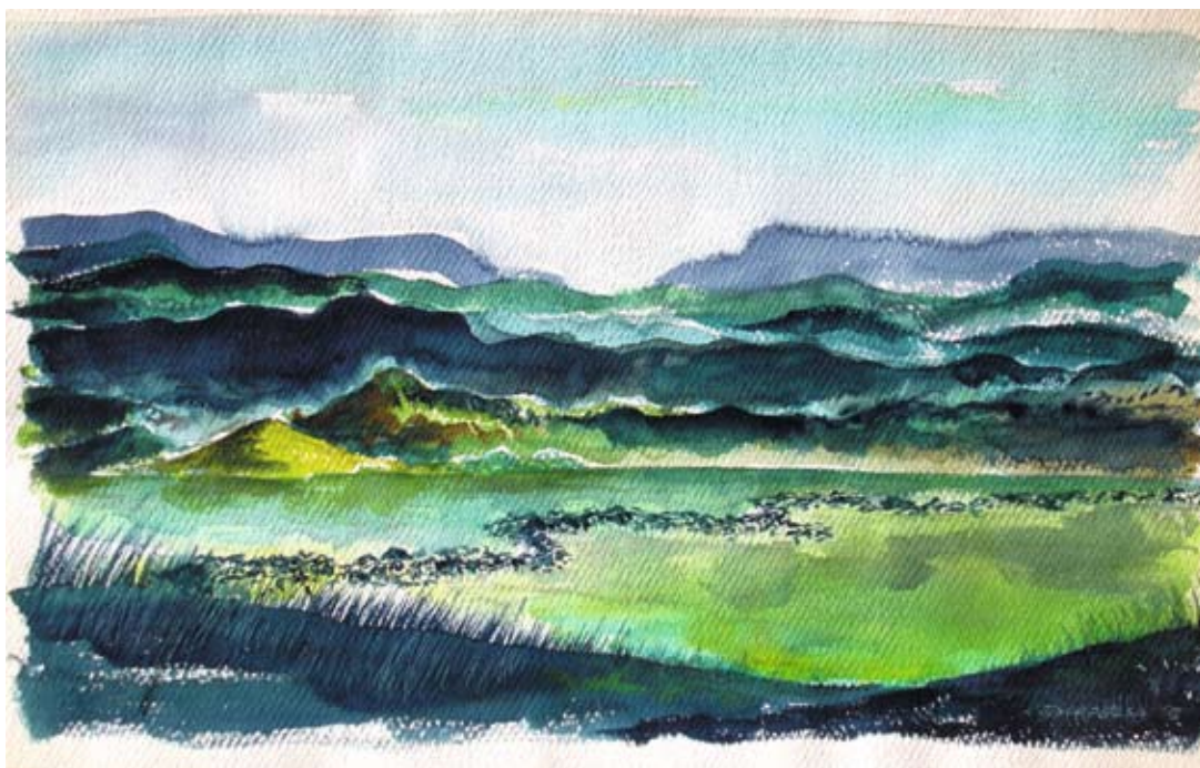
Study for New Guinea Landscape #2 (Dark Valley), 1955 Watercolor on paper 14 x 20 in. (35,5 x 50,8 cm)