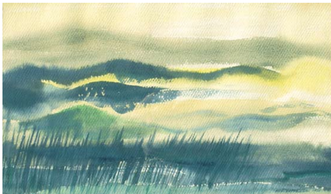
Study for New Guinea Landscape #1 (Markham Valley: Nadzab), 1955 Watercolor on paper 9 x 15 in. (22,8 x 38,1 cm)