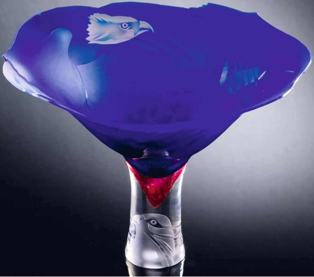
Cobalt Ruby Frit Eagles, undated Glass