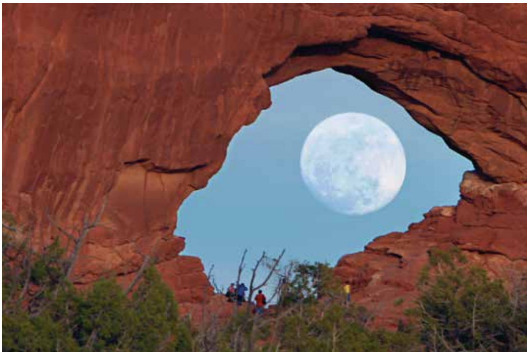
Moon in Arch , undated Archival photograph, 23 x 35 in. (58.4 x 88.9 cm)