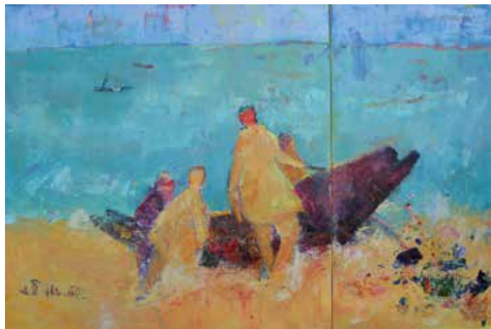
Fishermen of Mauritania, 2010

Mixed media on canvas, 47 x 32 in. (119.4 x 81.3 cm)