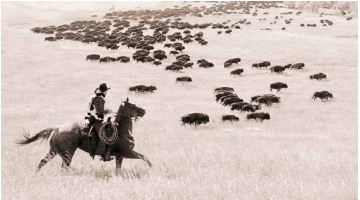
Once Upon a Time , undated. Photograph on Archival paper, 11 x 20 in. (27.9 x 50.8 cm)

This photograph was taken in 1999 in Custer State Park, South Dakota, where there is a yearly round up of over 1,000 buffalo. The herd is brought in to holding pens where they are culled and the health of the animals is checked. Thousands of people show up from all over the world to witness the event.