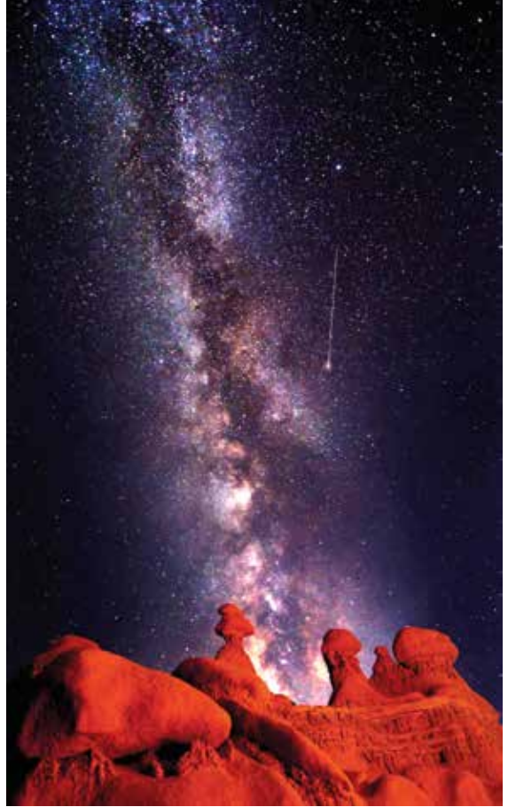
Shooting Star Over Hoodoos , undated Archival photograph, 23 x 38 in. (58.4 x 96.5 cm)

Bret Webster’s passion for capturing the desert in fresh and beautiful ways has put his photos into use by National Geographic magazine; the Natural History Museum of Utah; the Smithsonian Institution, Washington, D.C.; NASA’s “Astronomy Picture of the Day;” American Express; Islands magazine; New Scientist ; and many others. Additionally, Bret was a rocket scientist for twenty-seven years.