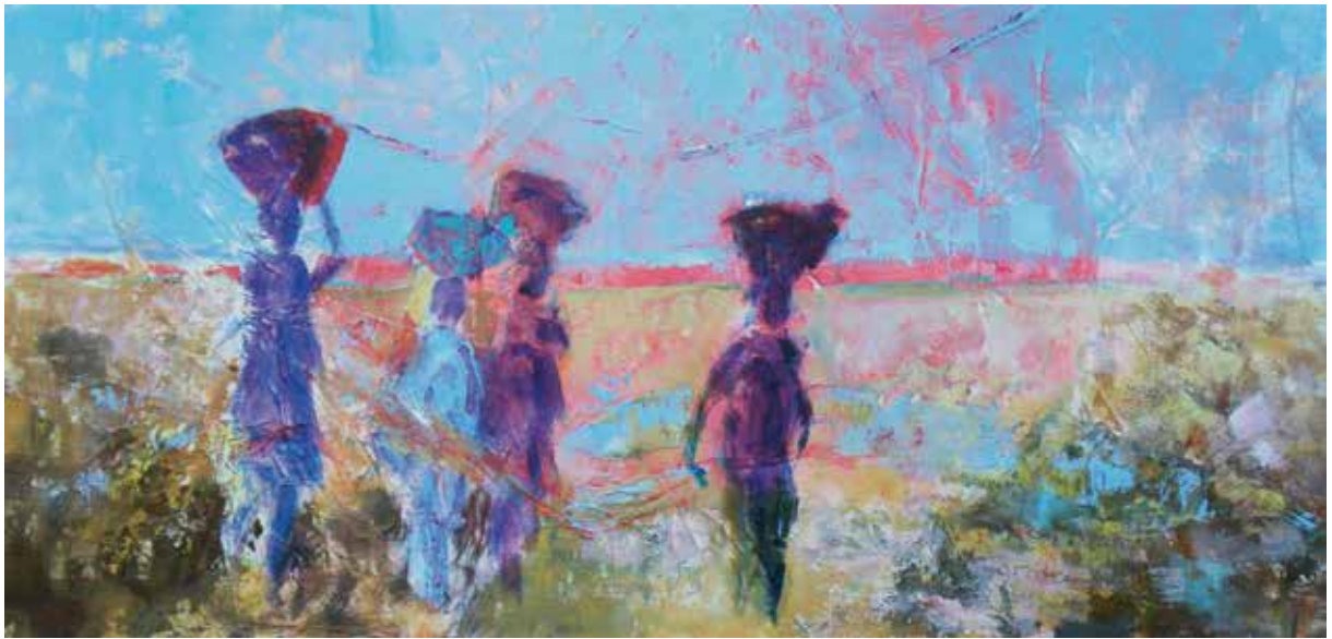
Water , 2009. Mixed media on canvas, 16 x 31 in. (40.6 x 78.7 cm).