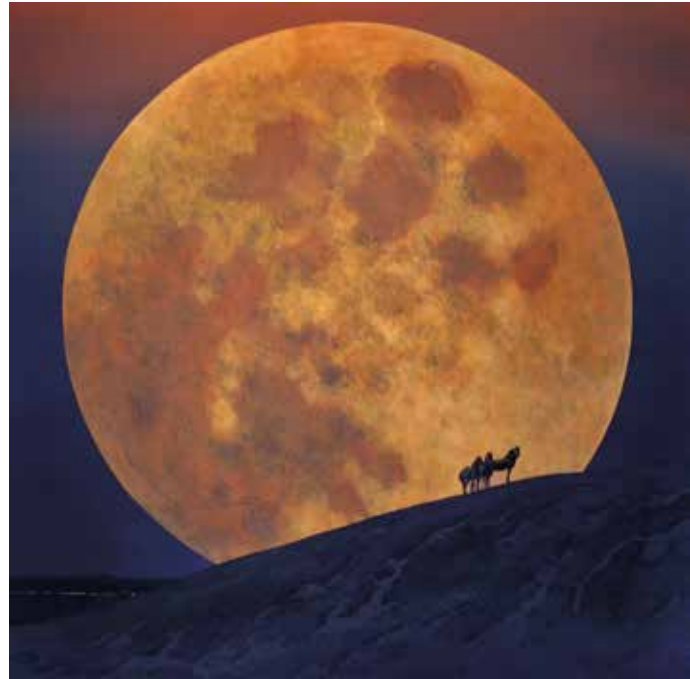
Moonrise and Horses 2, 2014

Epp eschews artistic labels, and does not like art, or himself, to be classified by locality, ethnicity, culture, faith, or other label. His work may be characterized by a certain clarity, a lack — but suggestive ordering mark — of human presence, and often a low horizon line that allows for a dominant, active, and expressive sky. Epps states simply that: “I’m a rural artist.” For him, the true question for any art remains: Is it any good?