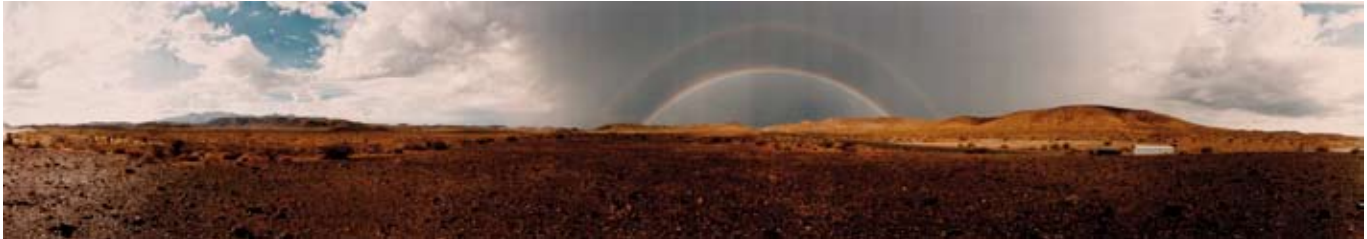
Mohave Rainbow , undated Panoramic photograph, 17 x 96 in. (43,2 x 243,8 cm)

Mohave Rainbow was taken in the American Rocky Mountains, which extend from New Mexico through the continental United States and finally terminate in the Yukon Territory near Alaska.