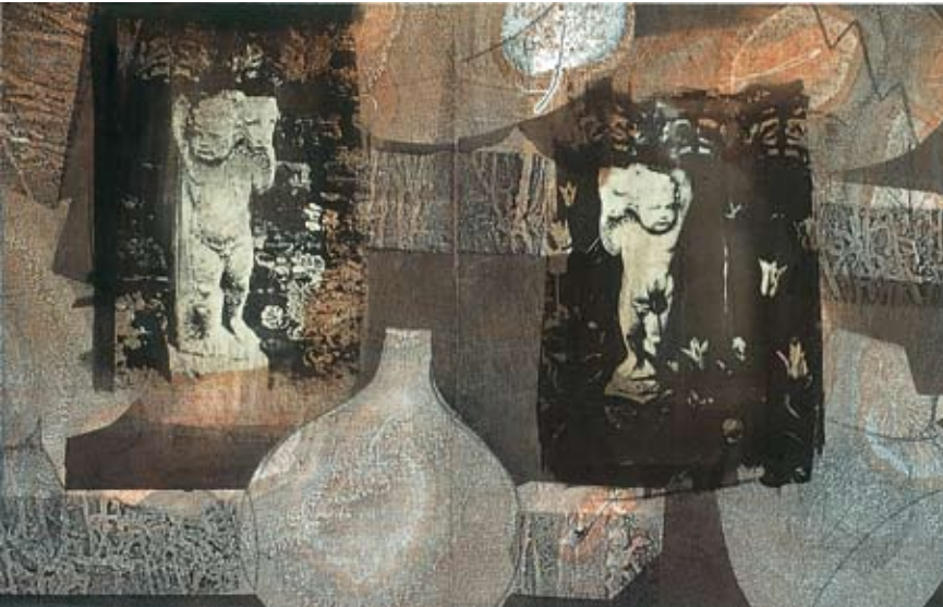
Alter Ego II, 2001 Monoprint, 13 x 20 in. (33 x 50,8 cm) Courtesy of the artist, Plymouth, Massachusetts