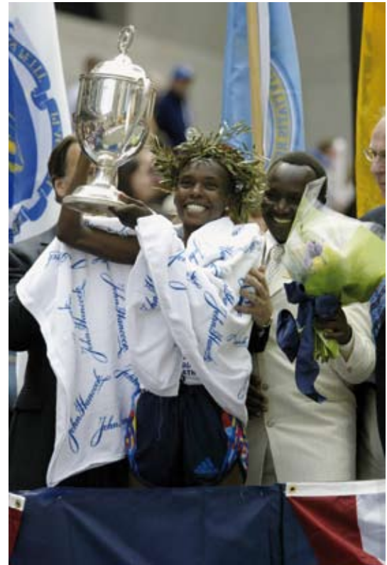
Rita Jeptoo – Winner 2006 Boston City Marathon, 2006 Photograph, 20 x 16 in. (50,8 x 40,6 cm)