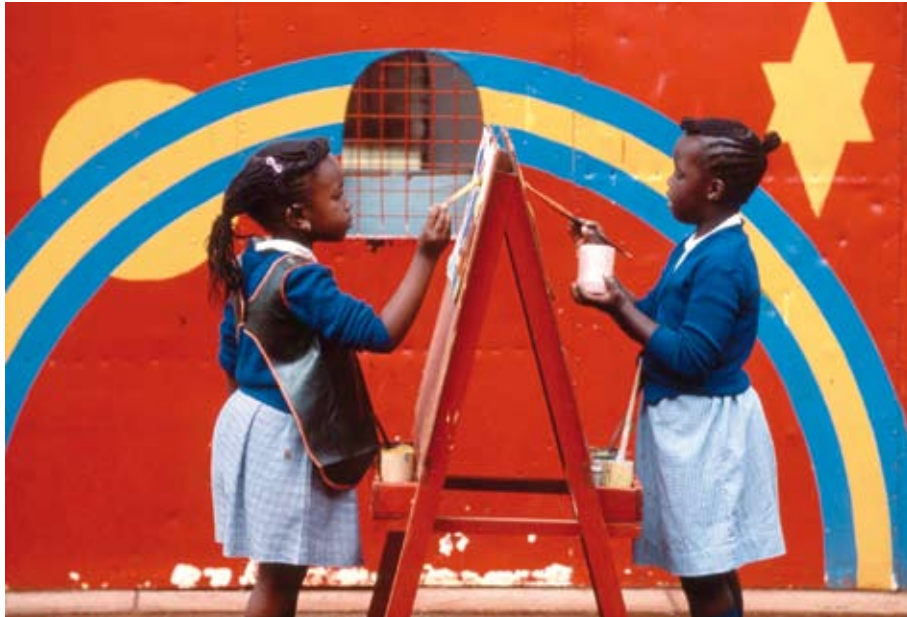
Students at the Kenya Headmistresses Association Kindergarten in Kenya, 1991