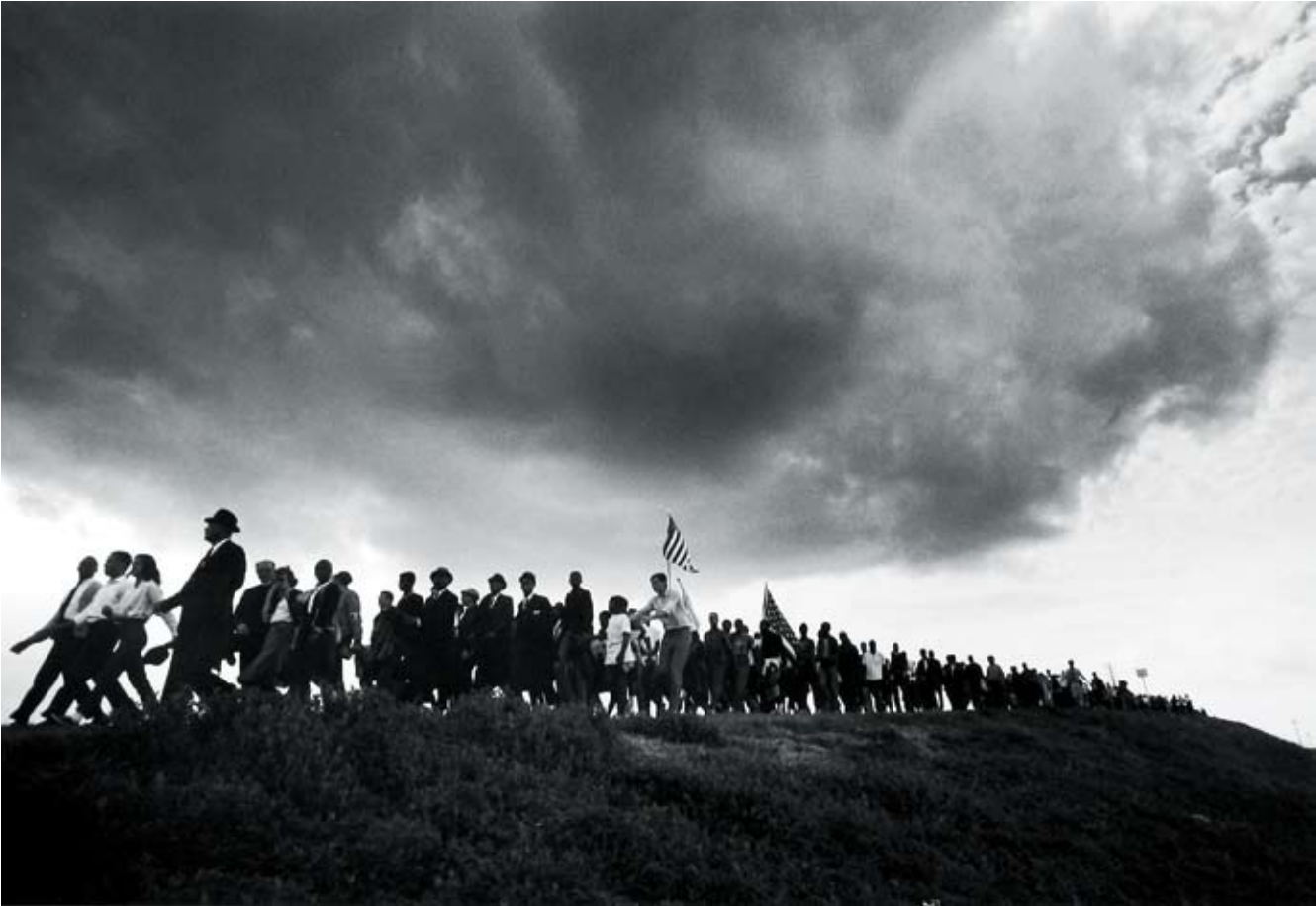
Selma to Montgomery March, 1965 , contemporary print Gelatin silver print, 20 x 24 in. (50,8 x 61cm)