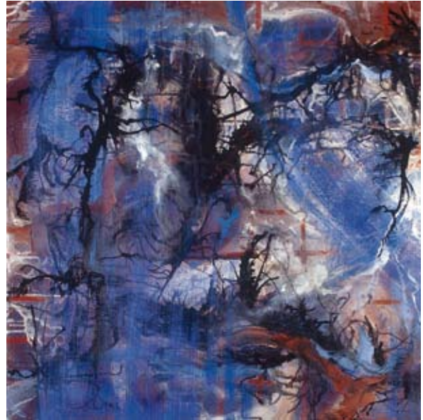
Thicket Grid IV, 2005 Acrylic on canvas, 30 x 30 in. (76,2 x 76,2 cm) Courtesy of the artist, Plymouth, Massachusetts