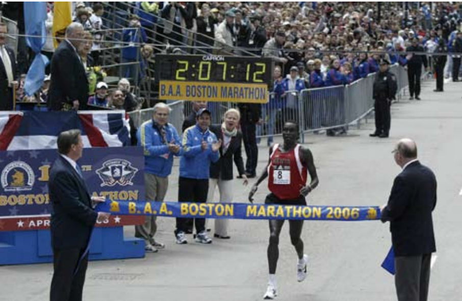
Robert Cheruiyot – Winner 2006 Boston City Marathon, 2006 Color photograph, 20 x 24 in. (50,8 x 61 cm)