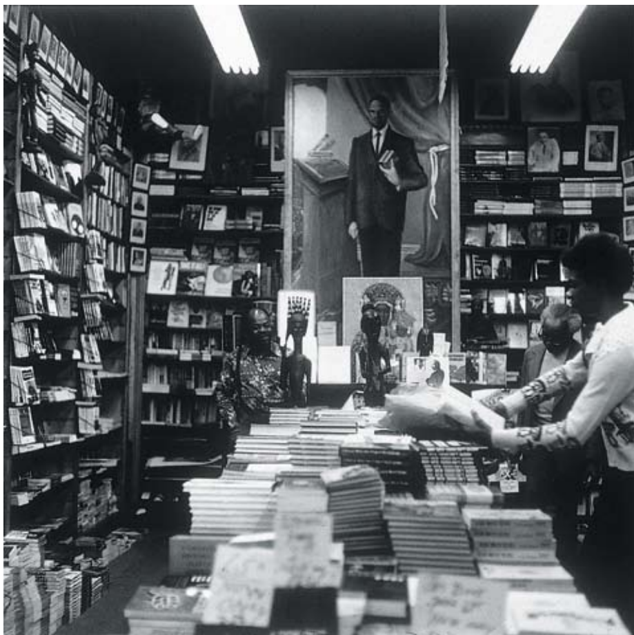
Harlem Book Store, c. 1970

Black and white photograph, 20 x 16 in. (50,8 x 40,6 cm)