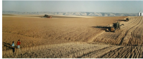
PENDLETON, OREGON , undated