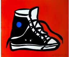
SNEAKER , 1994

http://ps1.org/studio-visit/artist/tom-slaughter