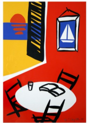
SUMMER 1992, 1993

Multi-colored screen print Gift of the Foundation for Art and Preservation in Embassies to ART in Embassies, Washington, D.C.