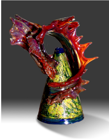
Dale Chihuly Gold Fiddleheads Glass sculpture Courtesy of the ART in Embassies Program, Washington, D.C.; Gift of Irvin J. Borowsky