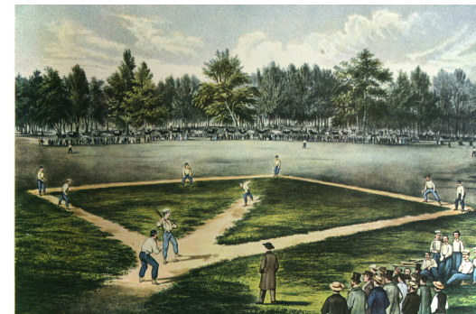
Currier and Ives The American National Game of Base Ball Color lithograph