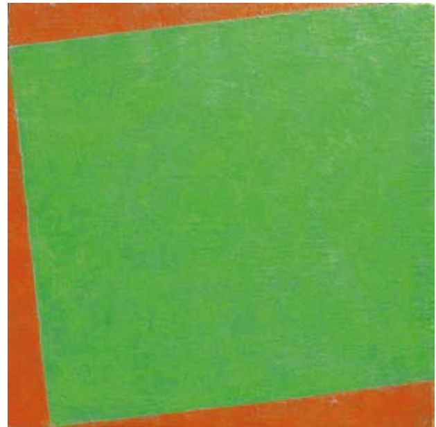
Viereckig , 2002 Acrylic on canvas 10 x 10 in. (25,4 x 25,4 cm) Courtesy of the artist, Washington, D.C.