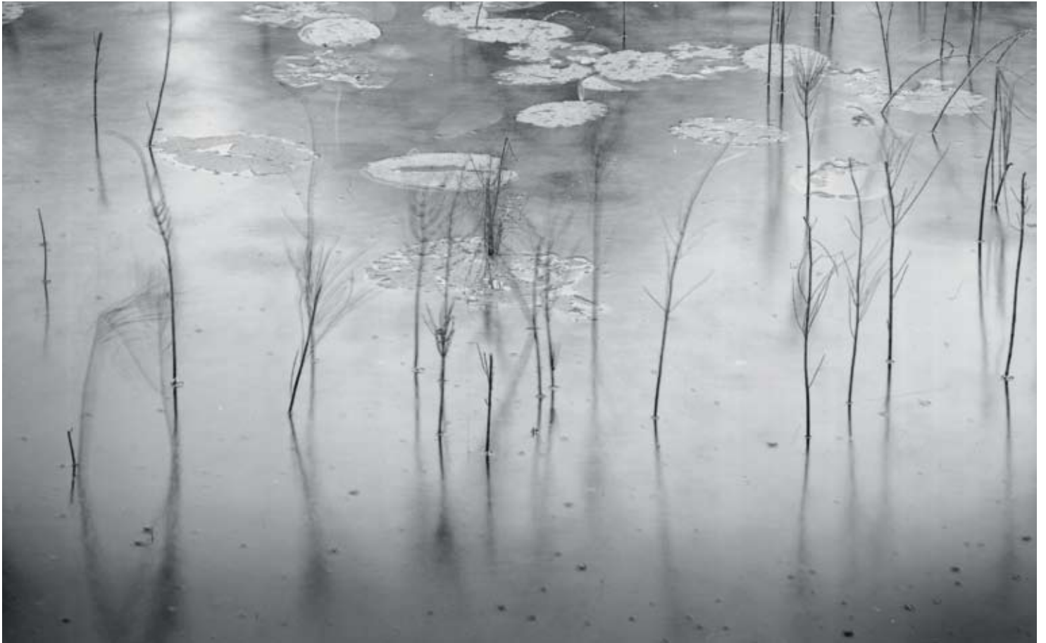
Homage to Monet, 2001 Silver print 27 x 32 in. (68,5 x 81,2 cm)