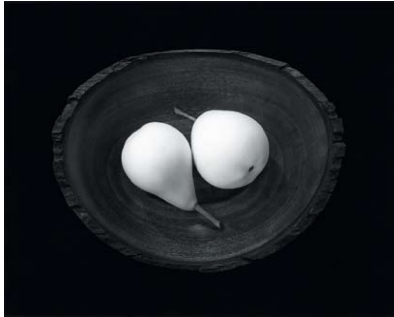
Two Pears , 1999 Gelatin silver print 15 x 18 in. (38,1 x 45,7 cm)