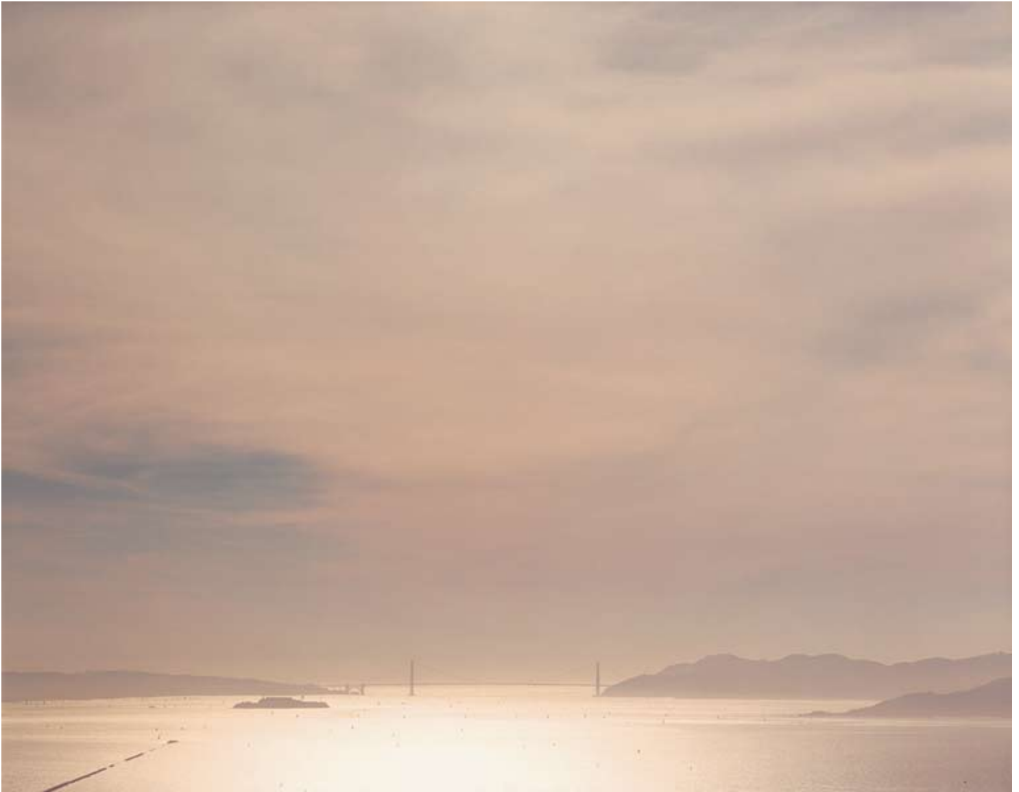
Golden Gate Bridge, 3.18.00, 4:00 pm , 2000, printed 2004 Chromogenic print 25 x 29 in. (63,5 x 73,7 cm)