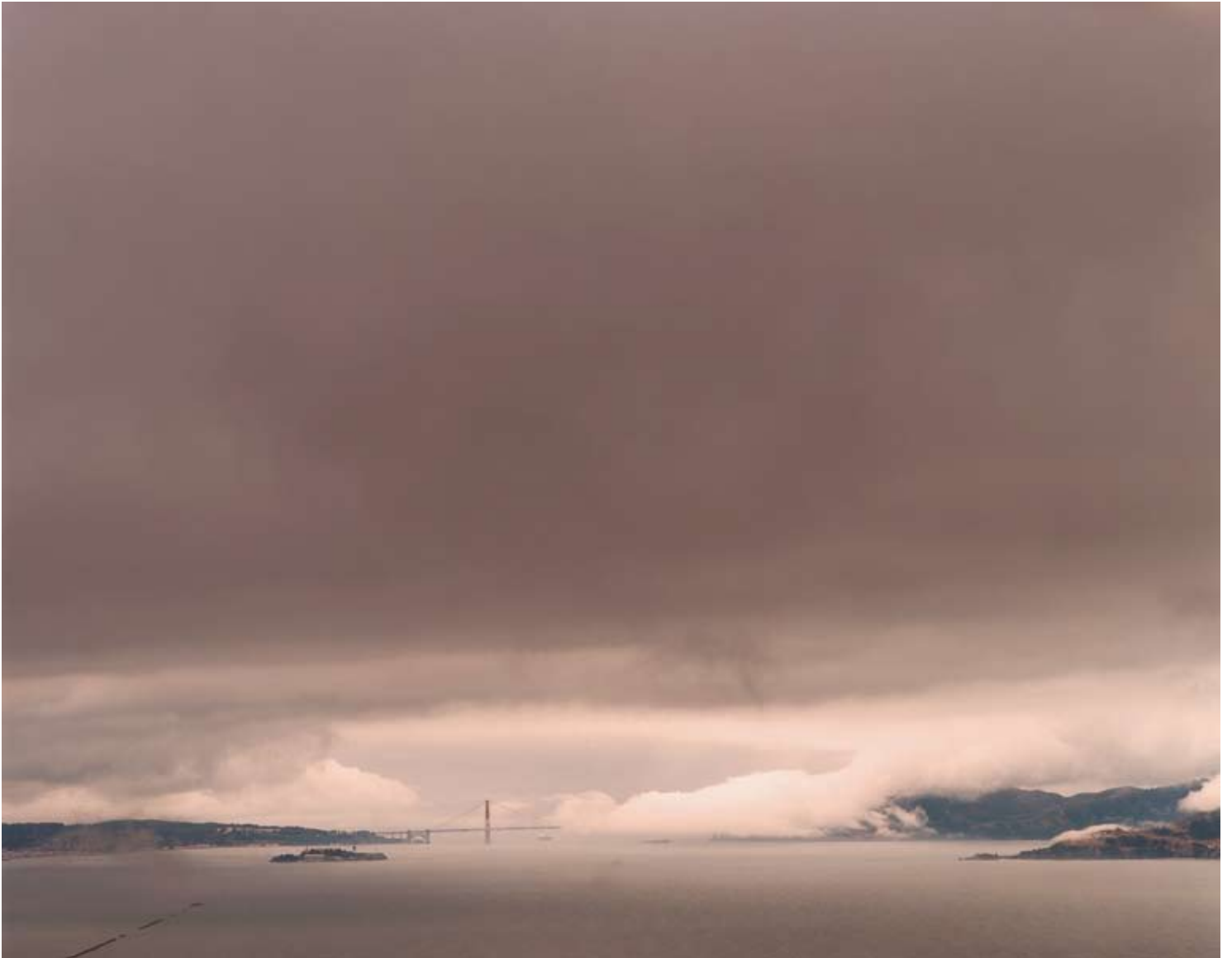
Golden Gate Bridge, 8.10.99, 12:48 pm , 1999, printed 2005 Chromogenic print 25 x 29 in. (63,5 x 73,7 cm)