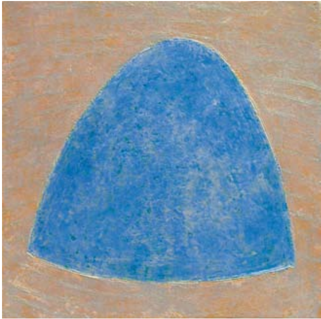
Sklo , 2002 Acrylic on canvas 10 x 10 in. (25,4 x 25,4 cm)