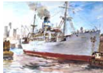
Reginald Marsh (1898-1954) Boat In Harbor - N.Y. Skyline, 1934 Watercolor on paper