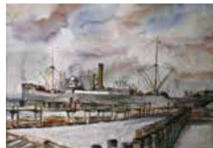
Reginald Marsh (1898-1954) Ferry Boat 1927 Watercolor on paper Courtesy of ART in Embassies, Washington, D.C.; Gift of William Benton