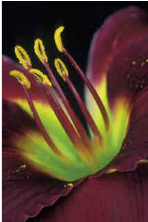
Maroon Lily, 2004. Photograph, 16 x 24 in. (40,6 x 61 cm). Courtesy of the artist, Dalton, Georgia

The ART in Embassies Program is proud to lead this international effort to present the artistic accomplishments of the people of the United States. We invite you to visit the ART web site, http://aiep.state.gov , which features on-line versions of all exhibitions worldwide.