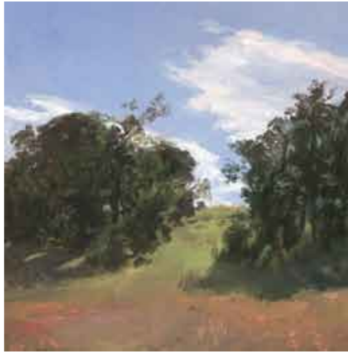
July 3, 2004 Oil on canvas, 13 1/2 x 13 1/2 in. (34,3 x 34,3 cm) Courtesy of the artist, Lawrence, Kansas

"Landscape painting and its enjoyment are not substitutes for social action." (P.H.)