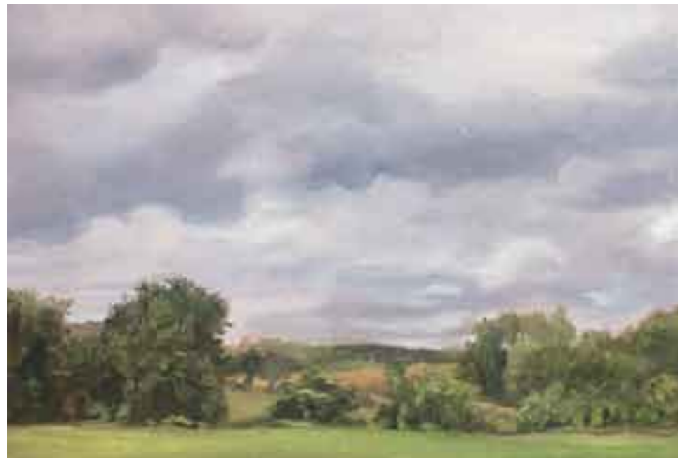
June 18, 2004. Oil on canvas, 9 x 12 in. (22,9 x 30,5 cm).