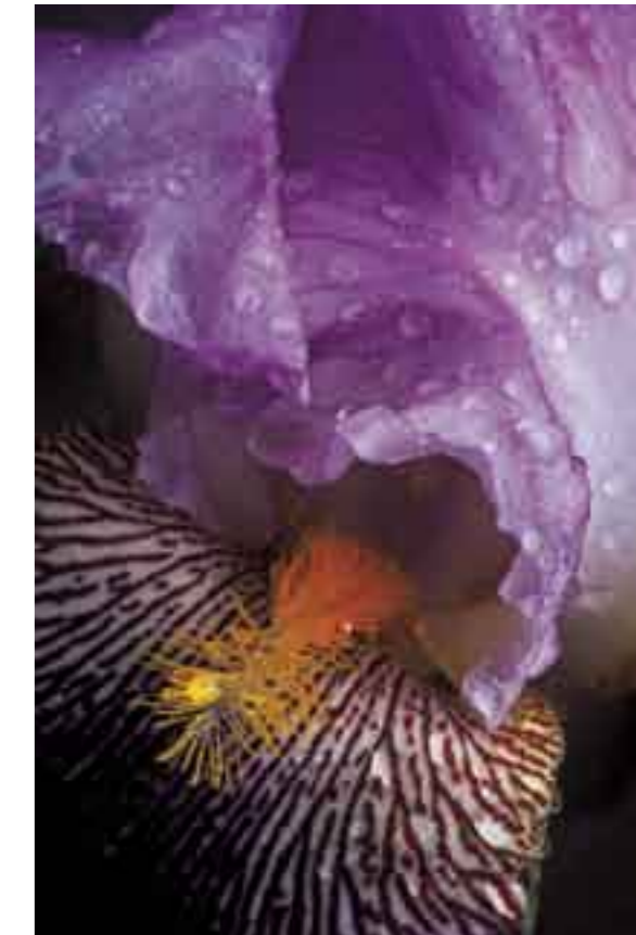
Purple Iris, 2004 Photograph, 16 x 24 in. (40,6 x 61 cm).