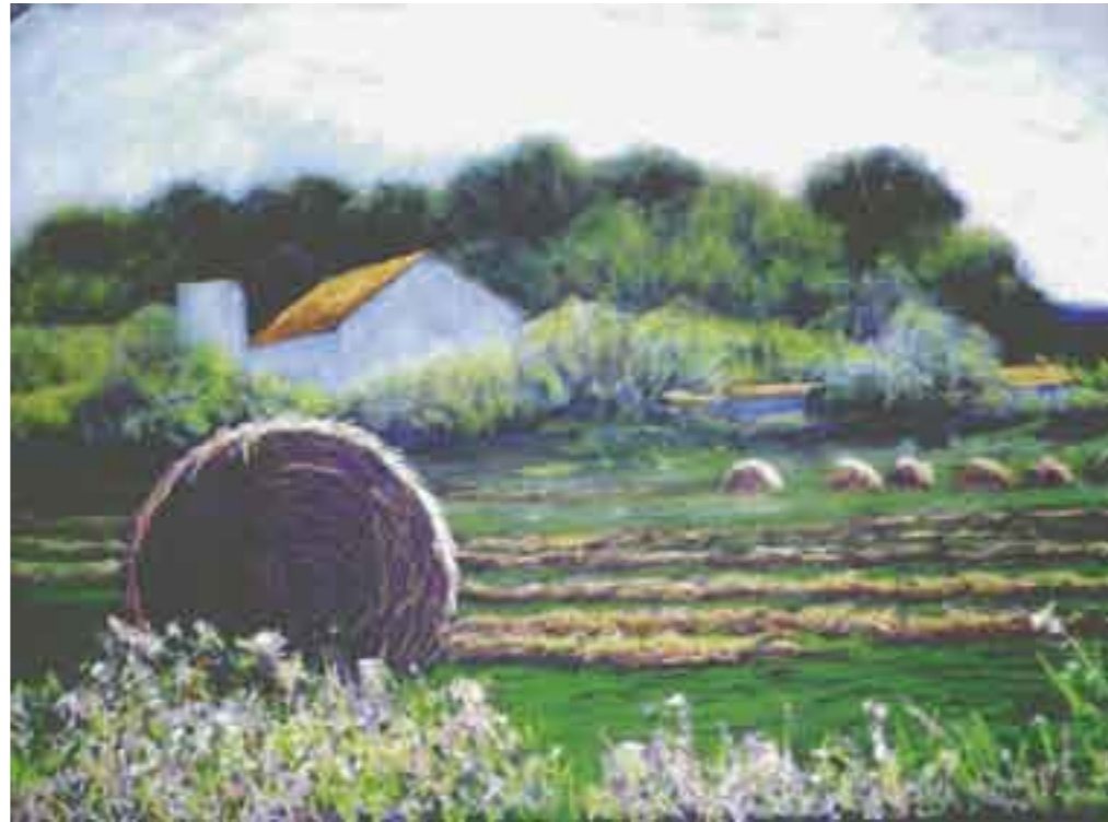
Potomac View Farm #1, 2004 Pastel, 22 x 30 in. (55,9 x 76,2 cm) Courtesy of the artist, Shepherdstown, West Virginia, and Mary Bell Galleries, Chicago, Illinois