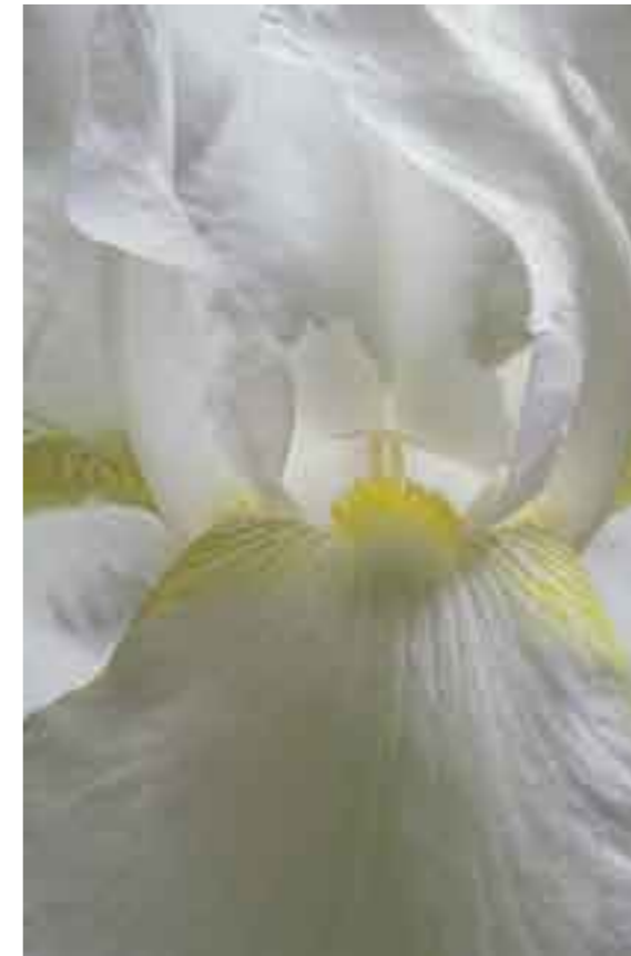
White Iris, 2004 Photograph, 16 x 24 in. (40,6 x 61 cm). Courtesy of the artist, Dalton, Georgia