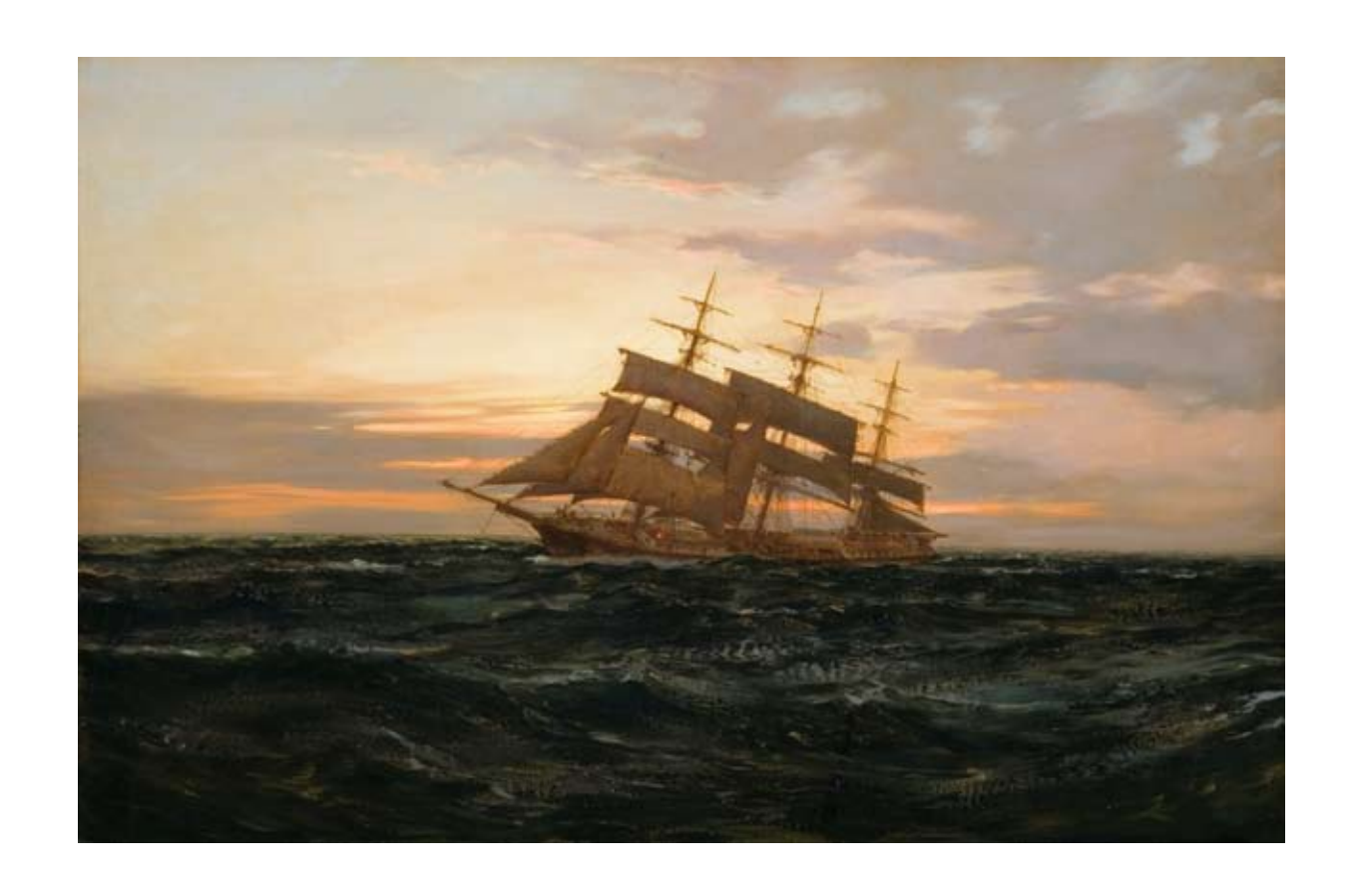
MASTS AGAINTS THE SKY, GLORY OF THE SEAS, 1920 Oil on canvas, 24 x 34 in. (61 x 86,4 cm)