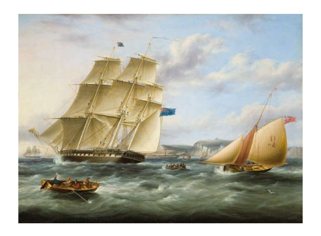
FRIGATE OFF DOVER, c. 1840

Oil on canvas, 25 ½ x 31½ in. (64,8 x 80 cm)