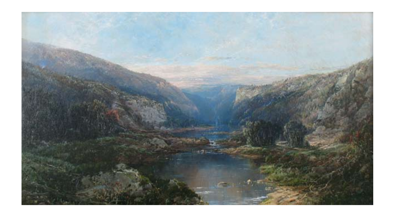
RIVER LANDSCAPE, POTOMAC, undated Oil on canvas, 26 \times 42 in. (66 \times 106,7 cm)