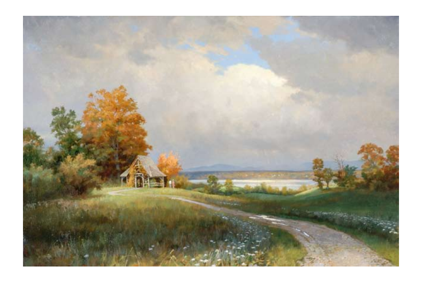
POET'S WALK, 2003 Oil on linen, 20 x 30 in. (50,8 x 76,2 cm) Courtesy of the artist, Rhinebeck, New York