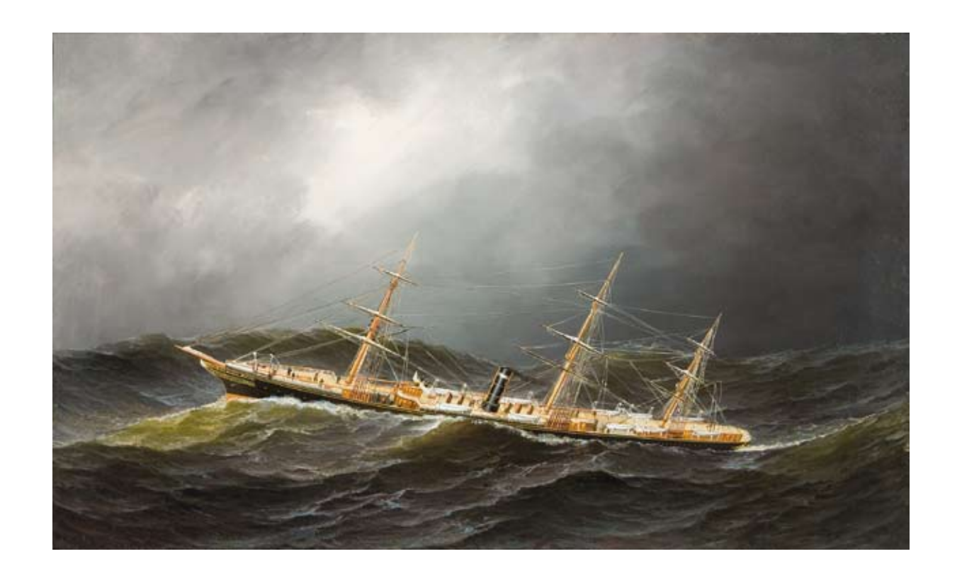
CITY OF BERLIN, 1874 Oil on canvas, 22 x 36 in. (55,9 x 91,4 cm)