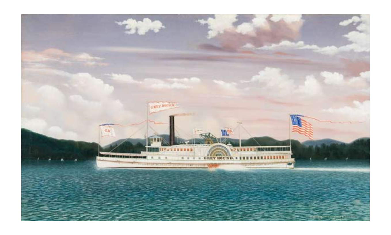
SIDEWHEEL STEAMER GREY HOUND, 1864

Oil on canvas, 32 x 52 in. (81,3 x 132,1 cm)