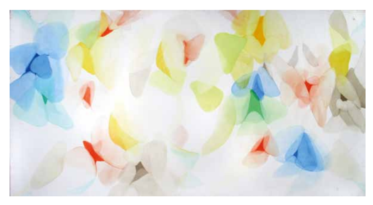
The Path of the Sun Leads to the Piper, undated. Oil on canvas, 91 \frac{1}{2} x 49 \frac{1}{2} in. (232.4 x 125.7 cm) Gift of the Estate of Alice Baber to ART in Embassies, Washington, D.C.