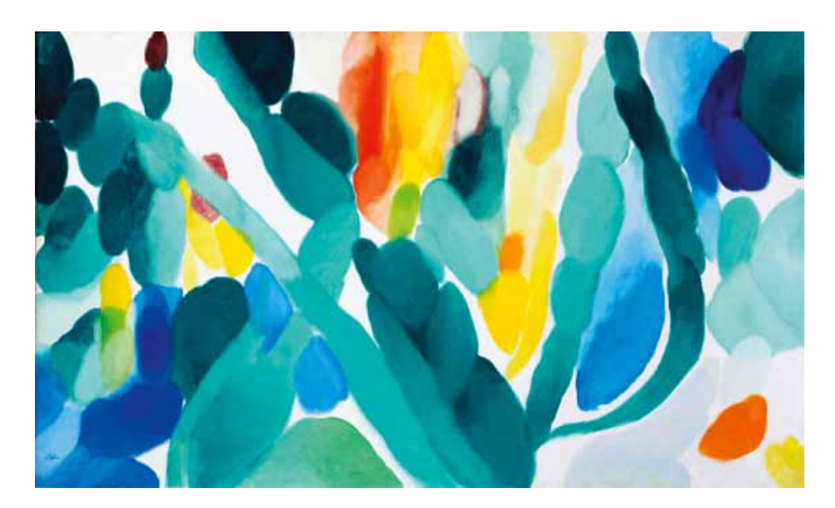
Green Swing, undated Oil on canvas, 38 ¾ x 64 ¾ in. (98.4 x 164.5 cm) Gift of Sachs Gallery, Illinois, to ART in Embassies, Washington, D.C.