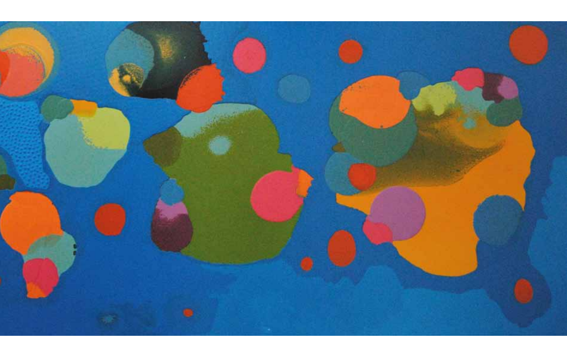
Bilingual , 2005 Polyurethane on panel 36 x 80 in. (91.4 x 203.2 cm)