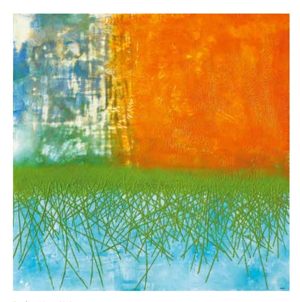
Sterling Moss, 2010 Encaustic on Dibond, 48 x 48 in. (121.9 x 121.9 cm)

Over the last decade Arkin has had many solo and group exhibitions, and her work has been included in many private, corporate, and public collections, including those of Crystal City, Virginia; Rehoboth Beach, Delaware; and the District of Columbia's Art Bank Collection.