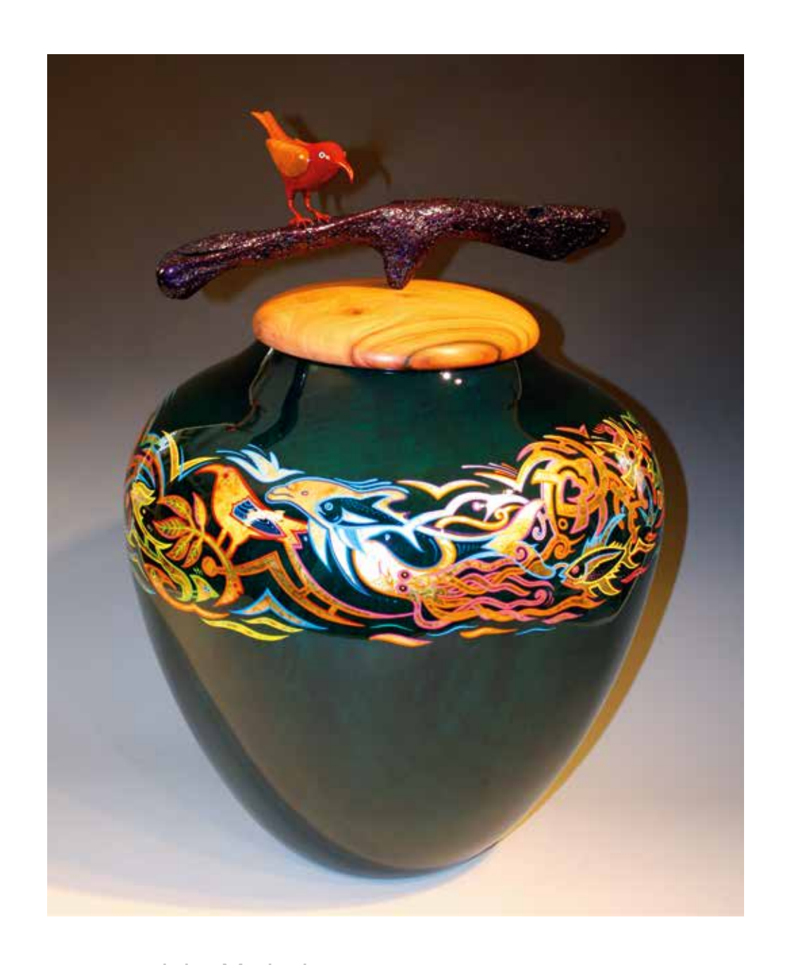
John Mydock Oasis (collaboration with Elmer Adams), 2013 Carved Norfolk Island pine, pearlized transparent color, pin striping and gold, 26 x 16 in. (66 x 40,6 cm)