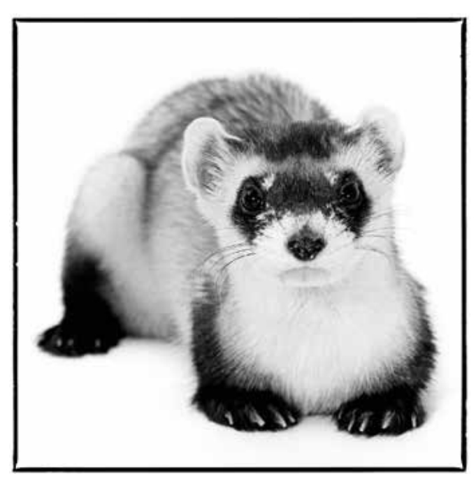
Susan Middleton Black Footed Ferret , undated Black and white photograph 36 \times 36 \text{ in. } (91,4 \times 91,4 \text{ cm})