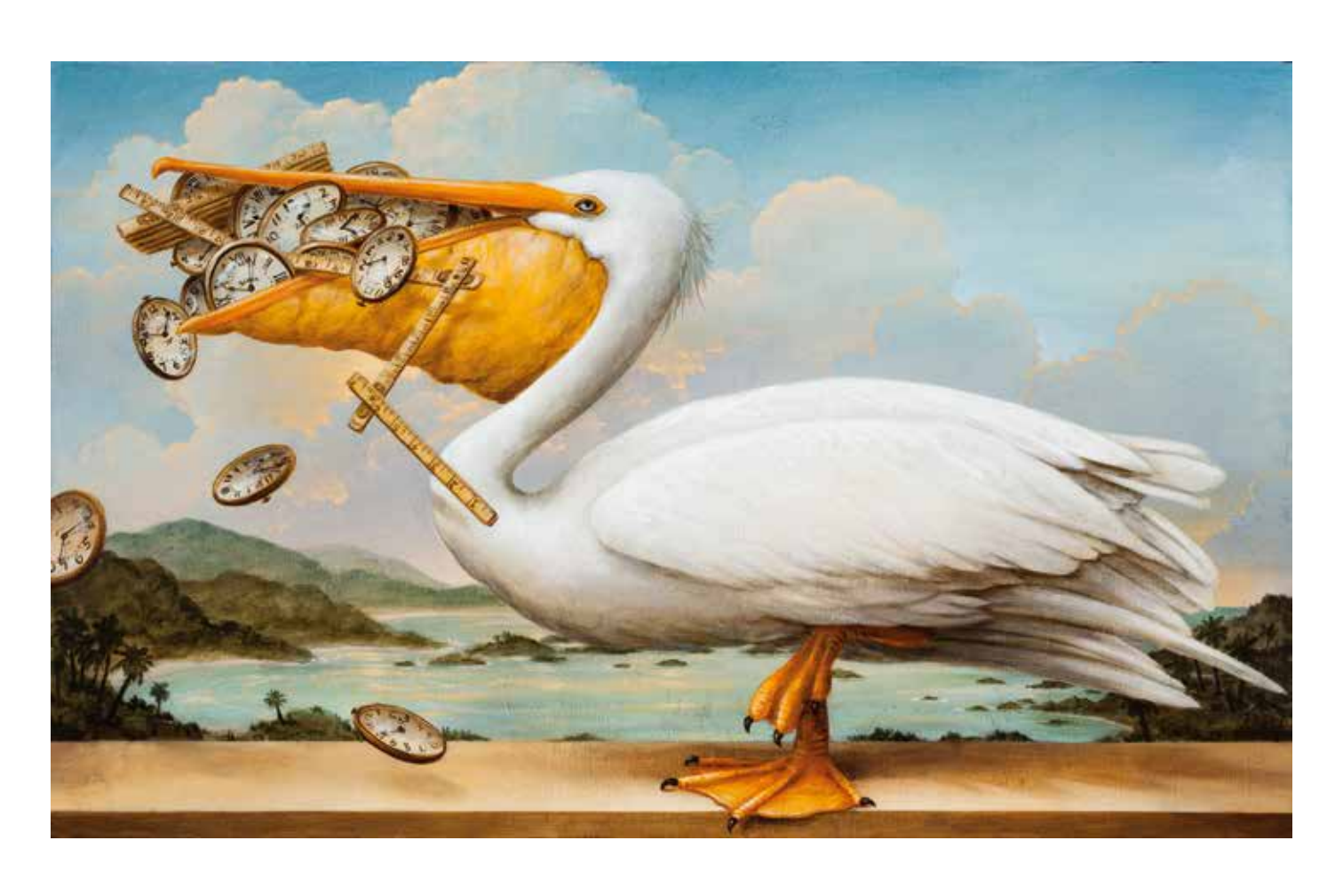
Kevin Sloan Birds of America: The Worrier, 2013 Acrylic on canvas, 28 x 45 in. (71,1 x 114,3 cm) Courtesy of the artist, Denver, Colorado