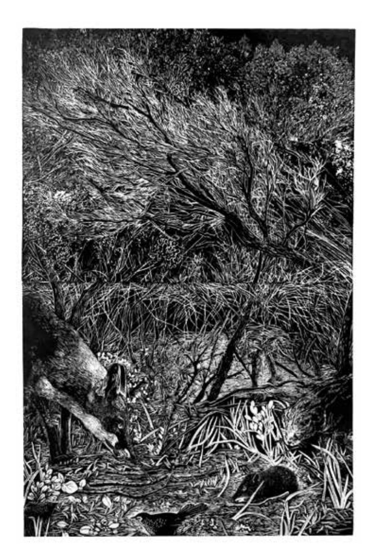
Endangered , undated Linocut, 51 <sup>3</sup>/<sub>16</sub> x 33 <sup>7</sup>/<sub>16</sub> in. (130 x 85 cm) Courtesy of the artist, Victoria

http://netsvictoria.org.au/new-artistpage-3