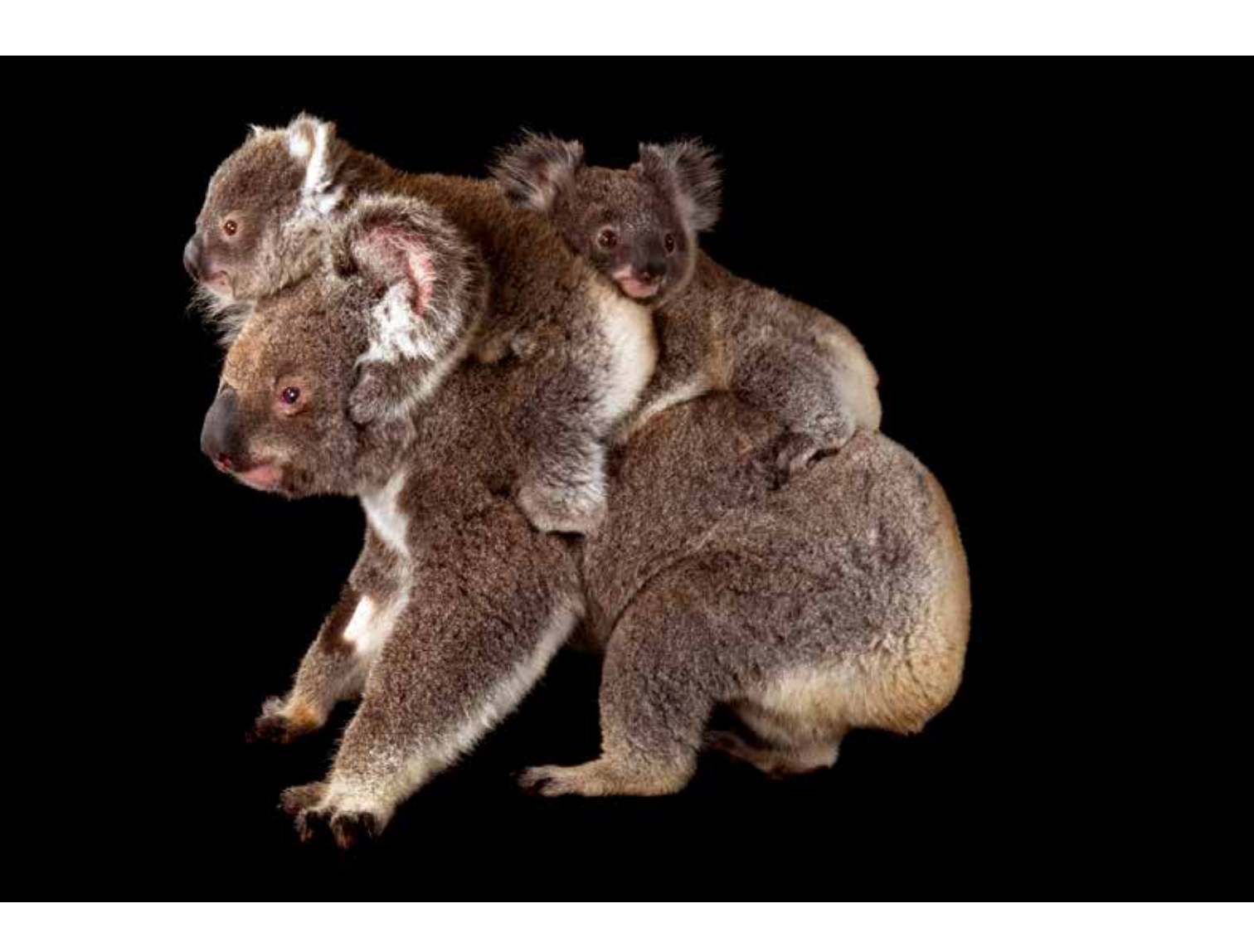
Joel Sartore Koala Mother and her Joeys, undated Color print on dibond from digital image, 20 x 30 in. (50,8 x 76,2 cm)