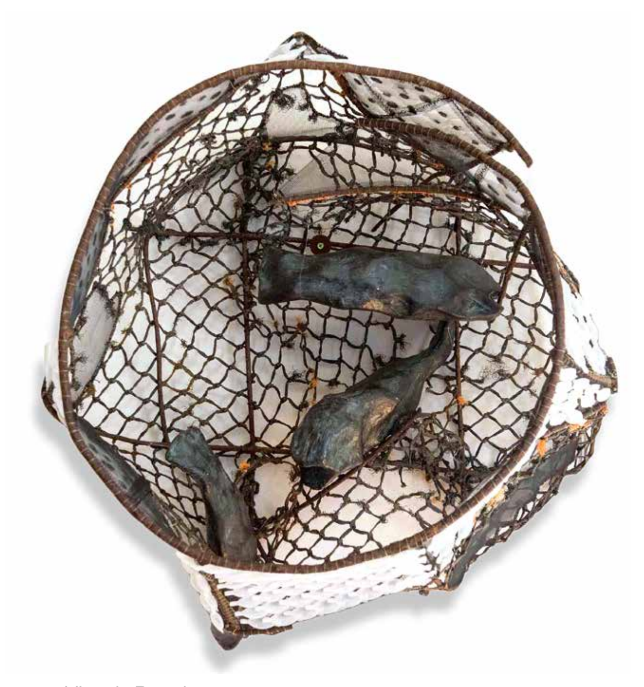
Victoria Beresin Shoal of Shame, undated. Mixed media, 16 % x 29 1/8 x 29 1/8 in. (42 x 74 x 74 cm)