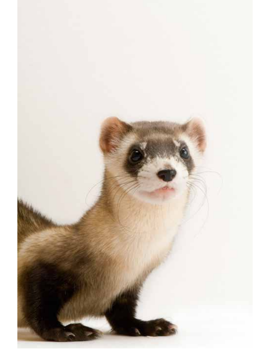
Joel Sartore American Black Footed Ferret, undated Color print on dibond from digital image, 30 x 20 in. (76,2 x 50,8 cm)