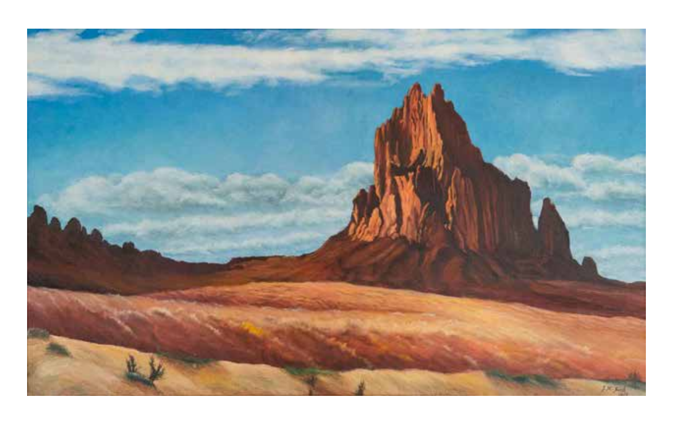
T. H. Tuck Shiprock, Navajo Nation, New Mexico Oil on canvas, 29 ½ x 49 ¾ in. (75 x 125 cm) Courtesy of an anonymous lender