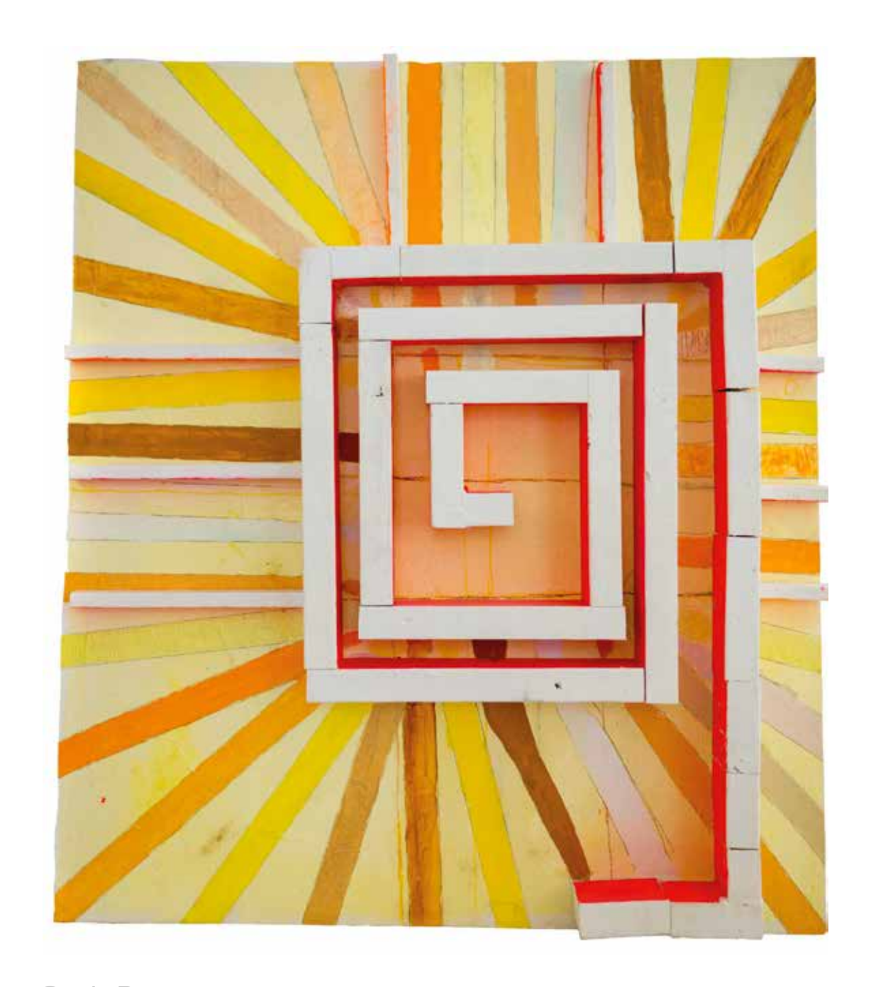
Cordy Ryman Luca, 2011. Acrylic, enamel and graphite on wood, 40 ¾ x 35 ½ x 5 in. (103,5 x 90,2 x 12,7 cm)