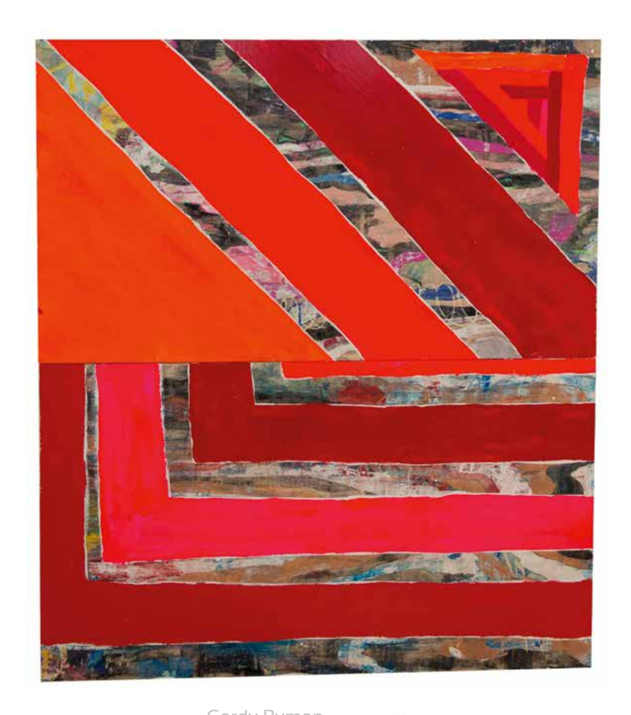
Cordy Ryman Shuff's Nest, 2011 Acrylic and enamel on wood, 44 \times 38 \times 2 in. (111.8 \times 96.5 \times 5.1 cm). Courtesy of the artist and Dodge Gallery, New York, New York