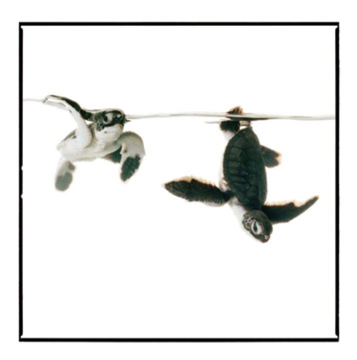
Susan Middleton Hawaiian Green Turtle Hatchling, Honu, Tern Island Field Studio, French Frigate Shoals, 17 September 2004 Photograph, 24 x 24 in. (61 x 61 cm)