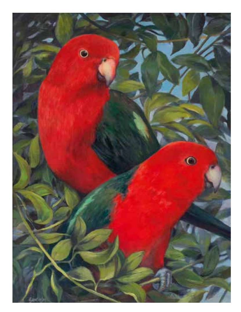
King Parrots, 2014 Acrylic on canvas, 39 x 29 ½ in. (99,1 x 74,9 cm) Courtesy of an anonymous lender