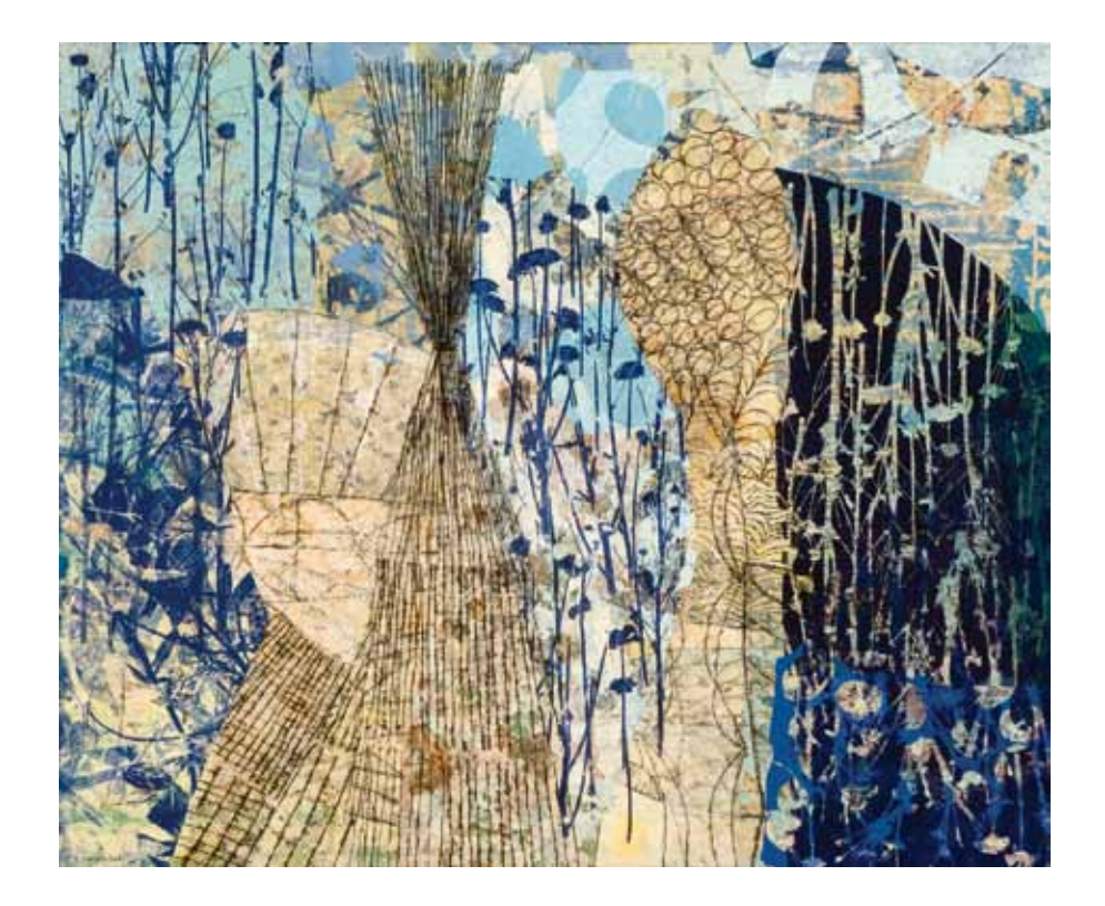
BLUE MORNING , 2008 Collage on canvas, 30 x 36 in. (76,2 x 91,4 cm)

"My work has always been inspired by nature: organic forms, cycles, seasons, land, water, sky, order, rhythm, repetition, growth, life, regeneration. For some time now, I have been using papers as the primary material in my work. The thin papers, which I print on, draw on, cut up, mix, are layered endlessly on the canvas. No 'found' papers are used. I print them all, using yarns, fabric, seeds, pressed plants, and other organic material.