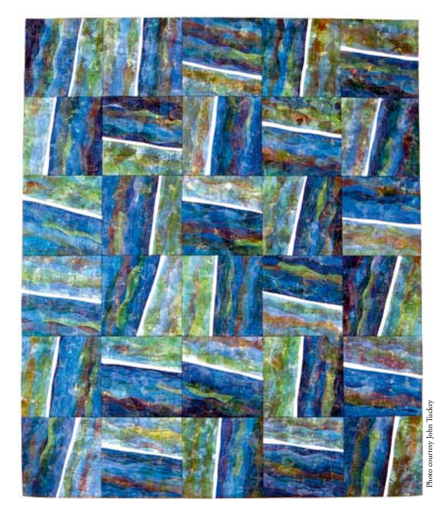
OCEANIC, 2008 Painted silk, 70 x 60 in. (117,8 x 152,4 cm)

www.neldawarkentin.com www.artiqueltd.com