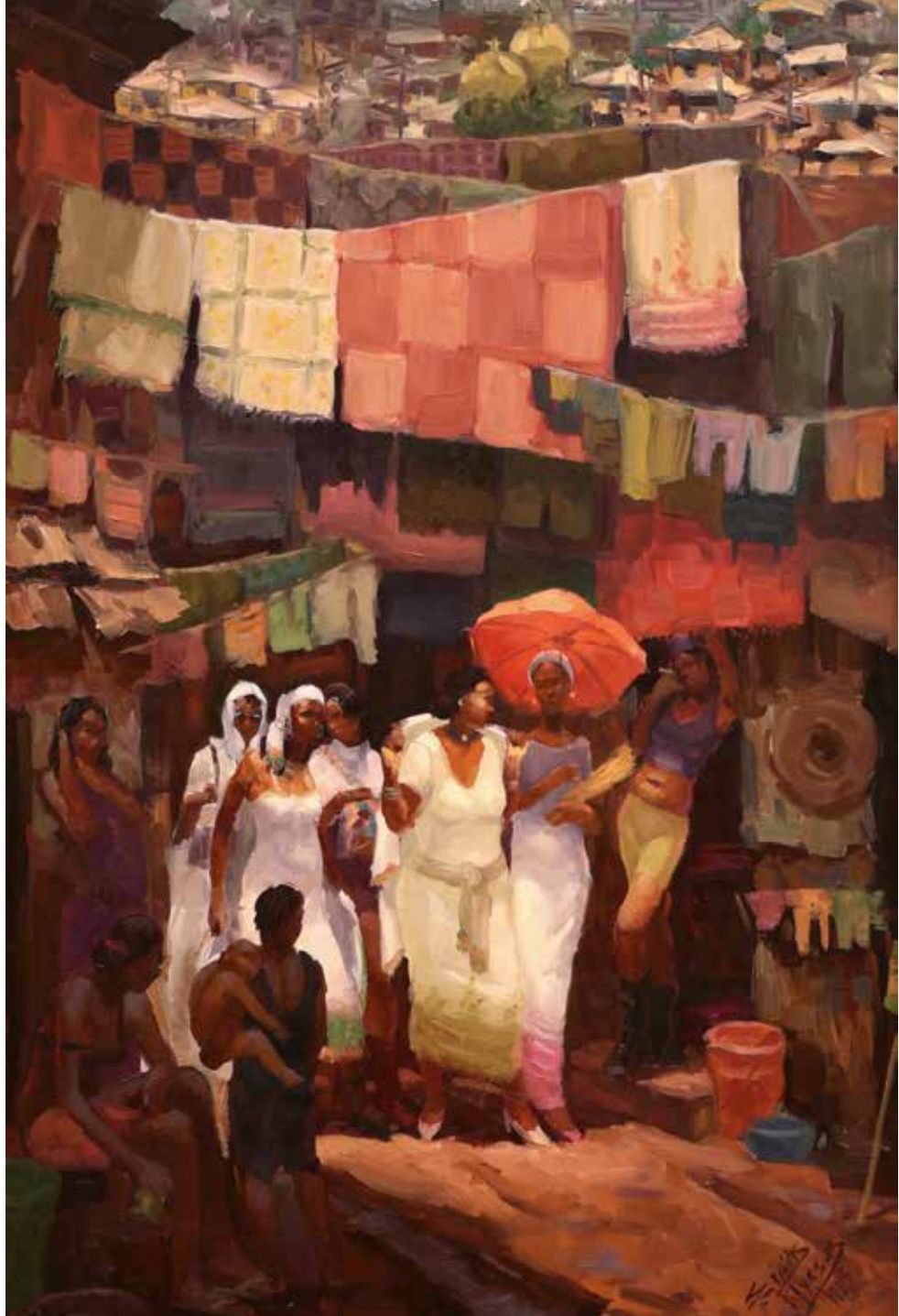
Life by Red Light, 1997 Oil on canvas, 47 ½ x 31 ½ in. (120,7 x 80 cm)