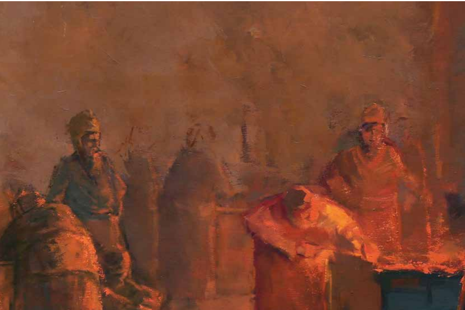
Cafe Workers , 1996. Oil on canvas, 39 \frac{3}{8} x 78 \frac{3}{4} in. (100 x 200 cm). Courtesy of the artist and the School of Fine Arts & Design, Addis Ababa University, Ethiopia