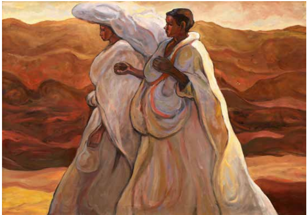
Ladies in White Robes , 2000. Oil on canvas, 33 1/16 x 44 7/8 in. (84 x 114 cm). Courtesy of the artist and the School of Fine Arts & Design, Addis Ababa University, Ethiopia