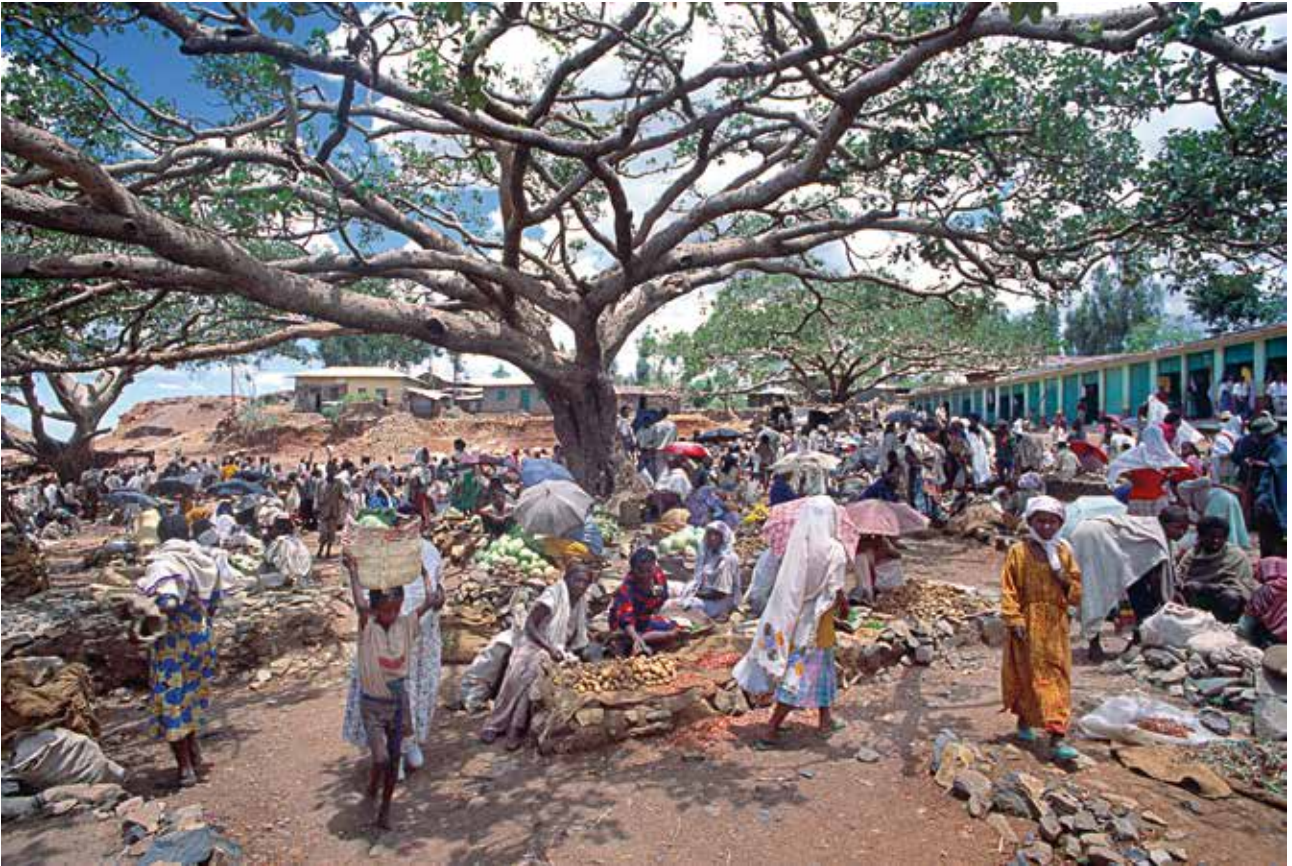
Tree of Life: Gondar Market , 1994. Color photograph, 26 x 37 in. (66 x 94 cm). Courtesy of the artist, Silver Spring, Maryland