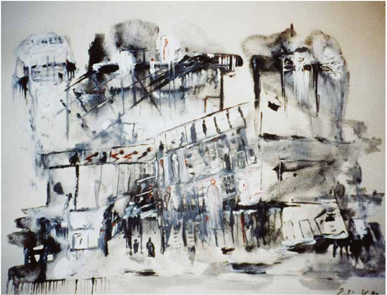
The House of Silence , 1995 Acrylic on paper, 35 x 43 in. (88,9 x 109,2 cm)