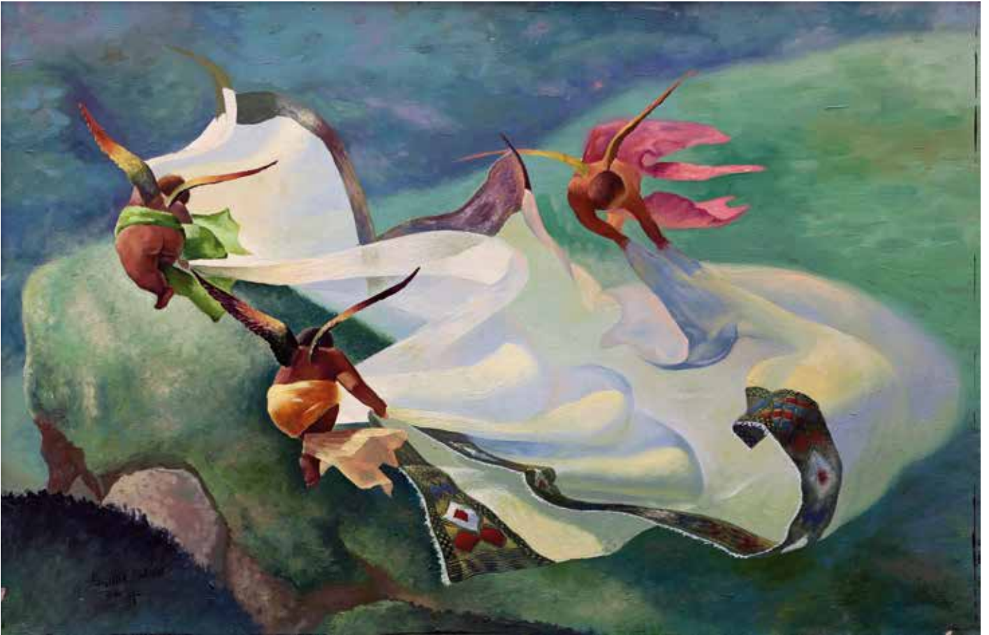
My Dream , 1994. Oil on canvas, 24 \frac{7}{16} x 37 \frac{3}{8} in. (62.1 x 94.9 cm). Courtesy of the artist and the School of Fine Arts & Design, Addis Ababa University, Ethiopia