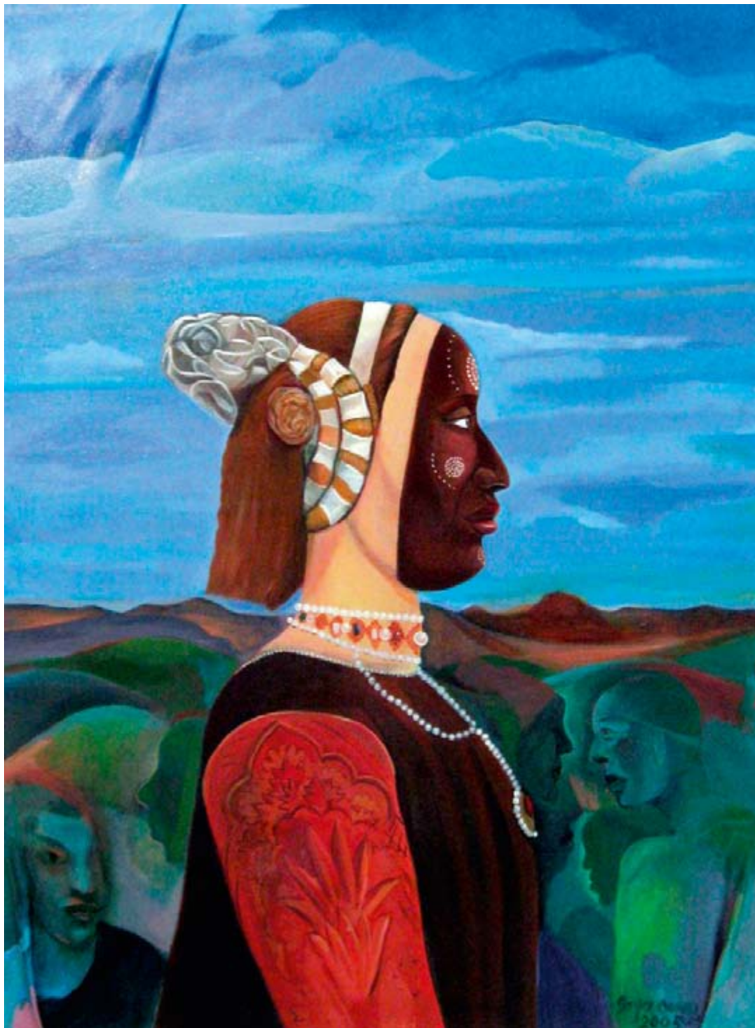
Revealed: Truths and Myths II, 2009-09 Acrylic on canvas, 26 1/2 x 18 1/2 in. (67.3 x 47 cm) Courtesy of the artist, Chicago, Illinois