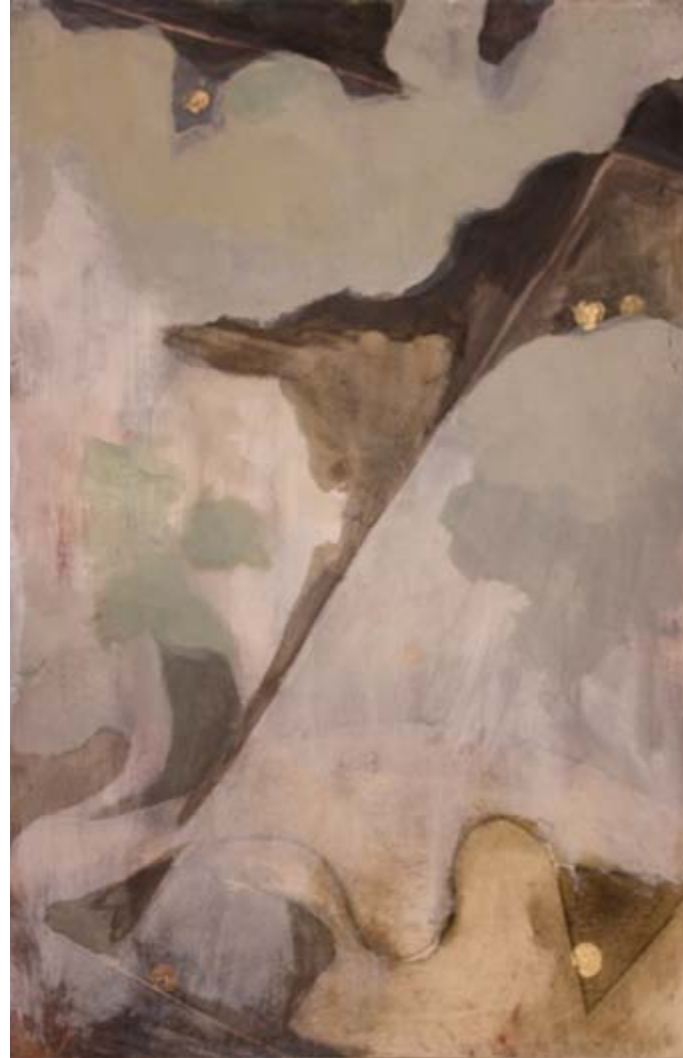
Missouri Study I, 2007 Collograph, gold leaf, and acrylic 26 x 18 in. (66 x 45,7 cm)