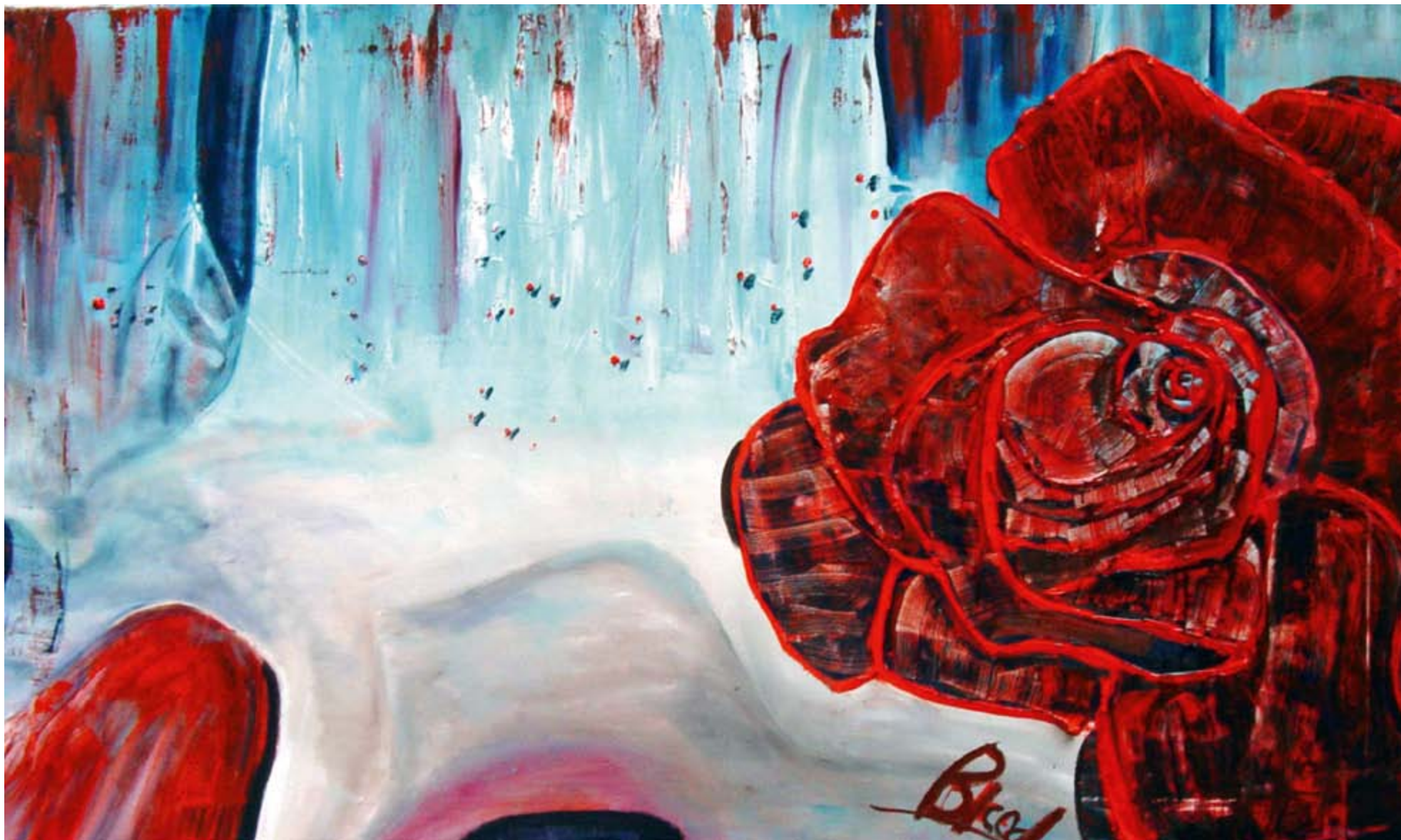
OP and Rose, 2008 Oil on canvas, 30 x 60 in. (76,2 x 152,4 cm)