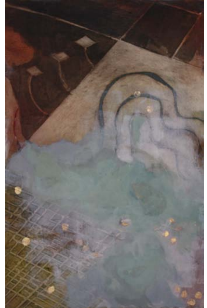
Missouri Study II, 2007 Collograph, gold leaf, and acrylic 26 x 18 in. (66 x 45,7 cm)