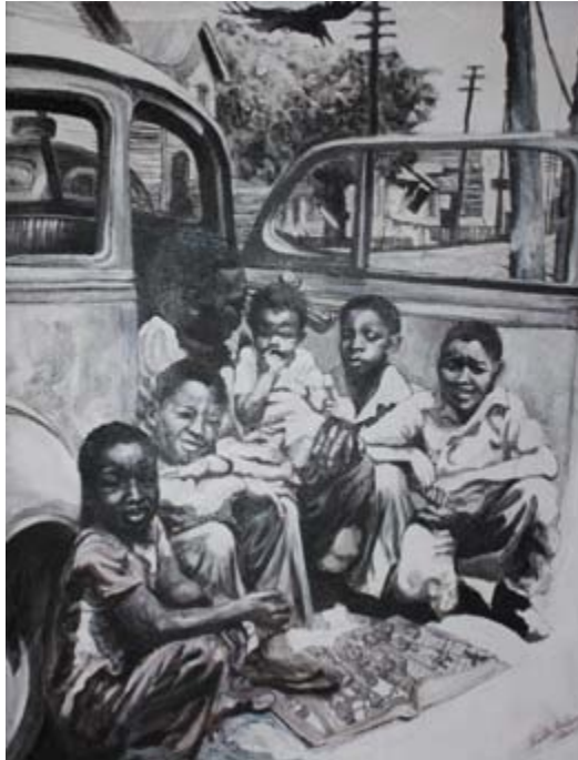
Remember the Amistad, 2009 Acrylic on board, 48 x 36 in. (121,9 x 91,4 cm)

"My two-dimensional work shows a continued interaction with human nature. I have combined the trusted realism of photography with the expressive drawing and color rendering from my own experience to present a view of unsung heroes giving life and meaning to their existence. Those who have no claim to fame are given their due respect by focusing on their portraits. My two-dimensional portraits show not only diversity in a physical sense, but also mentally. Beliefs in our society have a definite effect on our physical appearance. My goal is to communicate my life interpretations to the observer."