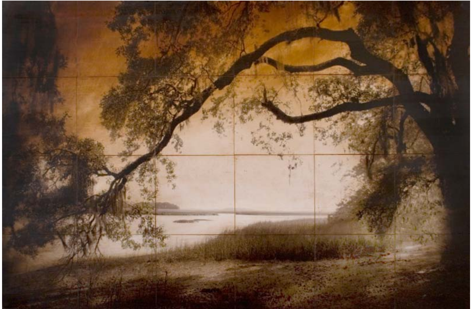
Botany Bay Plantation Salt Marsh, 2009 Archival pigment prints on board with oil and wax medium 48 x 72 in. (121,9 x 182,9 cm) Courtesy of the artist, East Point, Georgia