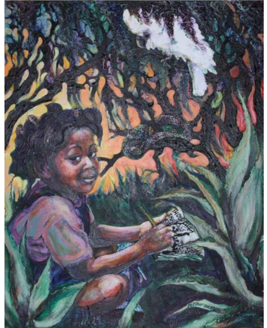
Priscilla's Diary, 2009 Acrylic on board, 24 x 18 in. (61 x 45,7 cm)