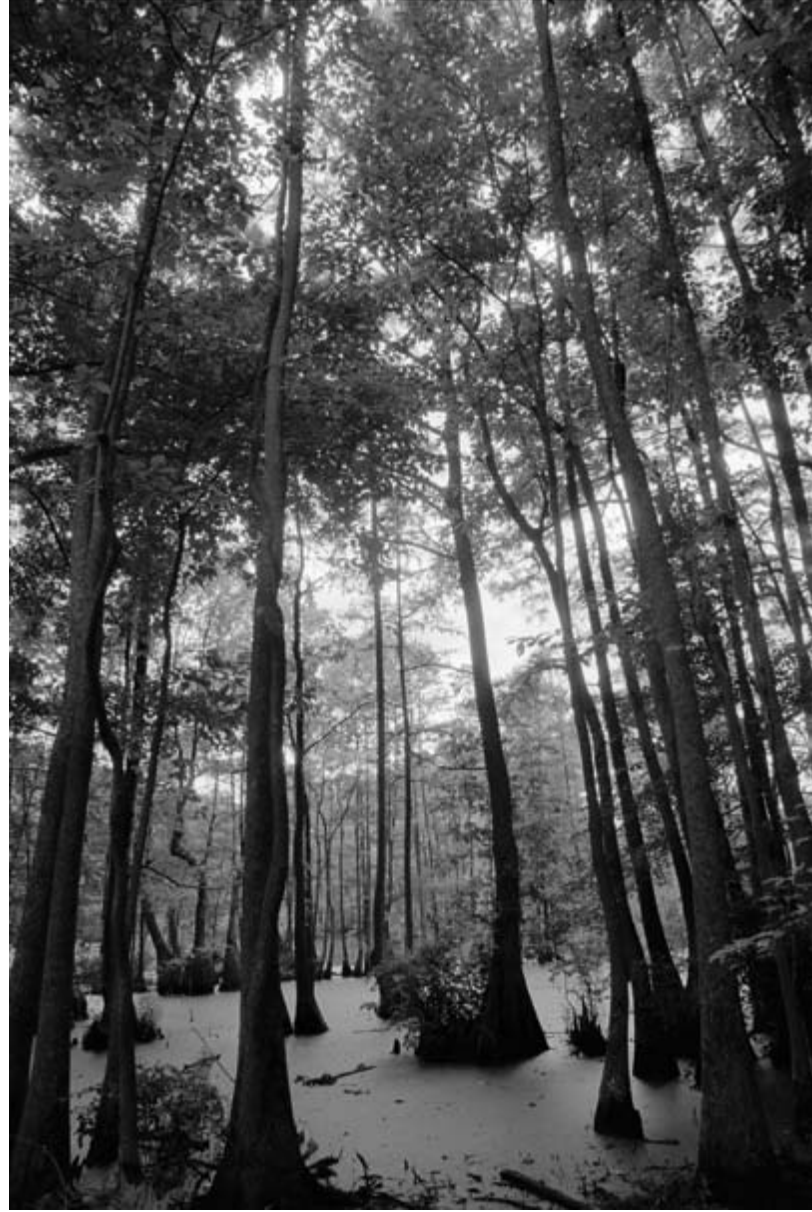
KENDALL MESSICK The Great Dismal Swamp (edition of 15), 1996 Silver gelatin print, 20 x 16 in. (50.8 x 40.6 cm)