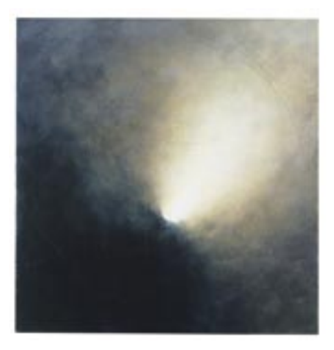
Oculus, 2002 Acrylic on linen 46 x 44 in. (116,8 x 111,8 cm)