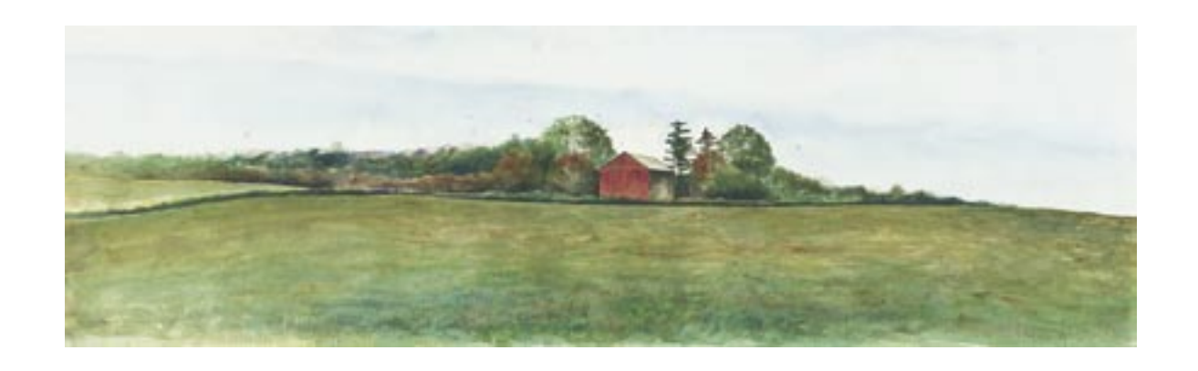
\label{eq:Reward Farm, undated} Watercolor, 12 x 41 \ ^{1/4} in. (30.5 x 104.8 cm) \\ Courtesy of the artist, Chadds Ford, Pennsylvania