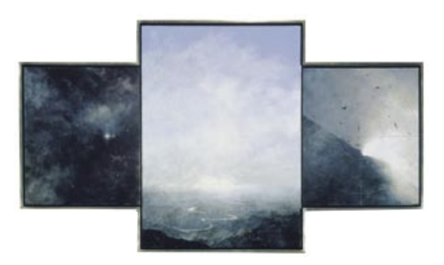
Watch, 2000 Acrylic on linen 50 x 89 in. (127 x 226,1 cm)