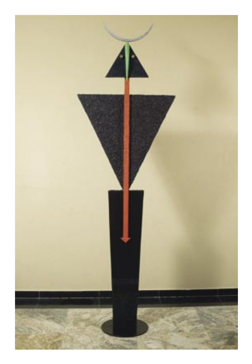
Moon Bird (preparatory study), c.\ 1997

Wood, metal, and paint 100 x 34 x 16 in. (254 x 86,4 x 40,6 cm) Courtesy of the artist, Abiquiu, New Mexico