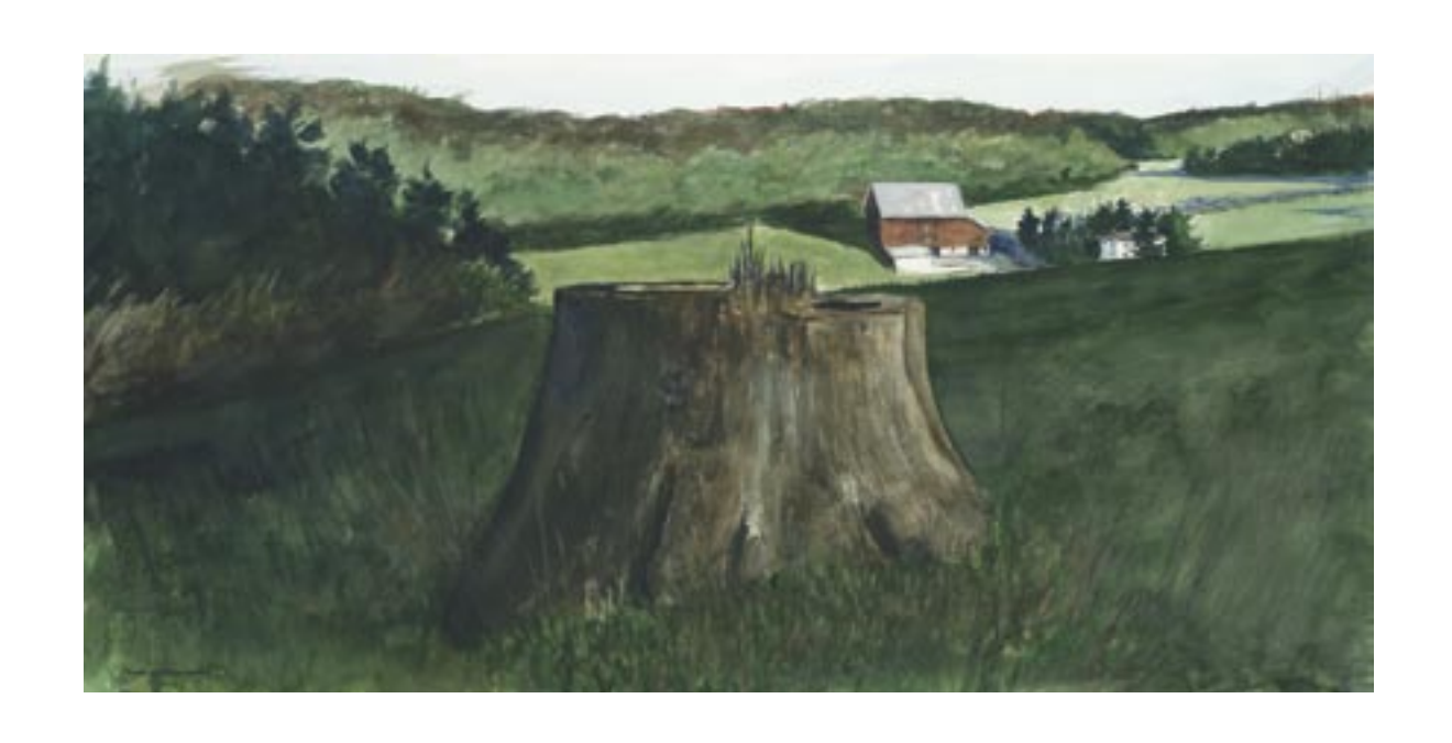
\begin{array}{c} \textbf{Old Cut}, \ \text{undated} \\ \text{Watercolor, 23} \ ^{7/8} \ \text{x} \ 42 \ ^{1/4} \ \text{in.} \ (60,6 \ \text{x} \ 107,3 \ \text{cm}) \\ \text{Courtesy of the artist, Chadds Ford, Pennsylvania} \end{array}