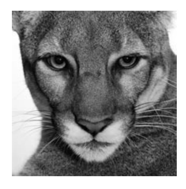
Felis concolor coryi (adult): Florida Panther Photographed: 1/23/1997; Lowry Park Zoological Garden, Tampa, Florida 48 x 48 in. (121,9 x 121,9 cm) Courtesy of the artists, San Francisco, California