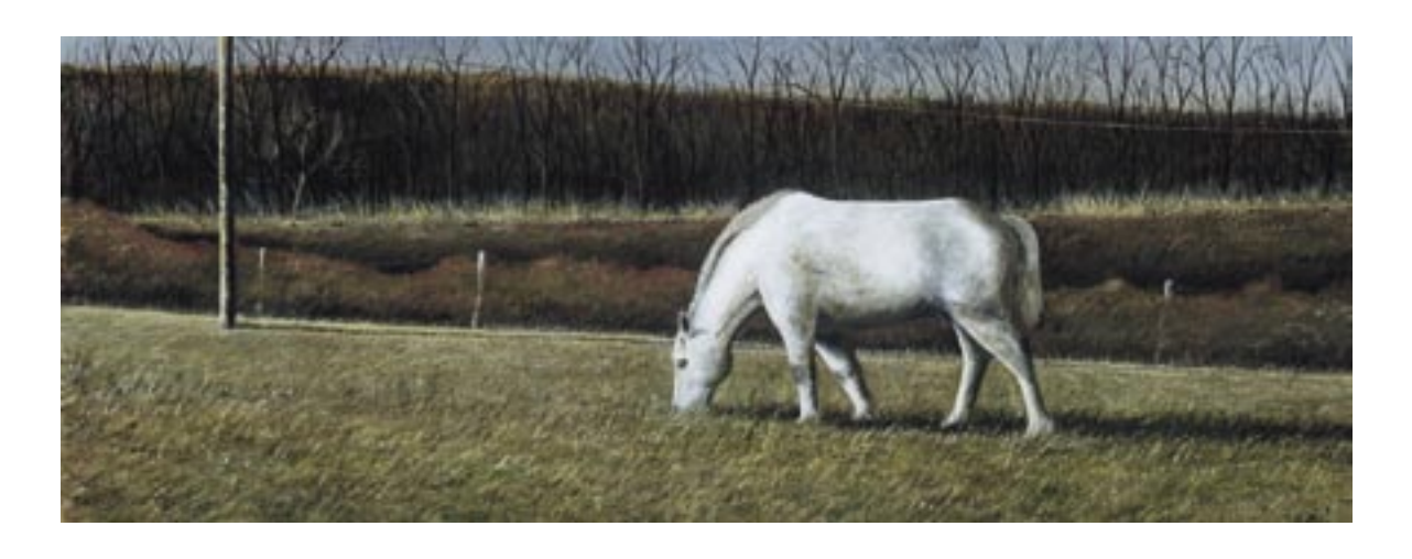
Percheron in Chadds Ford, undated Acrylic, 19\ ^3/4\ x\ 41\ ^3/4 in. (50,2 x 106 cm) Courtesy of the artist, Chadds Ford, Pennsylvania