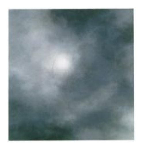
Pneuma, 2002 Acrylic on linen 46 x 44 in. (116,8 x 111,8 cm)