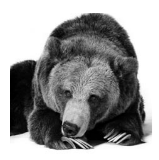
Ursus arctos horribilis: Grizzly Bear Photographed: 9/11/1991; Olympic Game Farm, Sequim, Washington 36 x 36 in. (91,4 x 91,4 cm) Courtesy of the artists, San Francisco, California