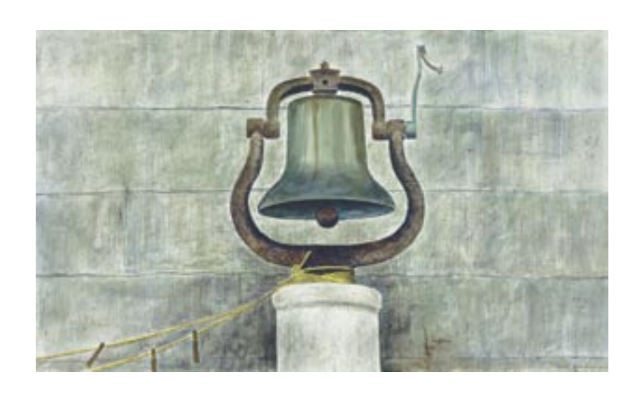
Pinned , undated Watercolor, 18 x 31 in. (45,7 x 78,7 cm)